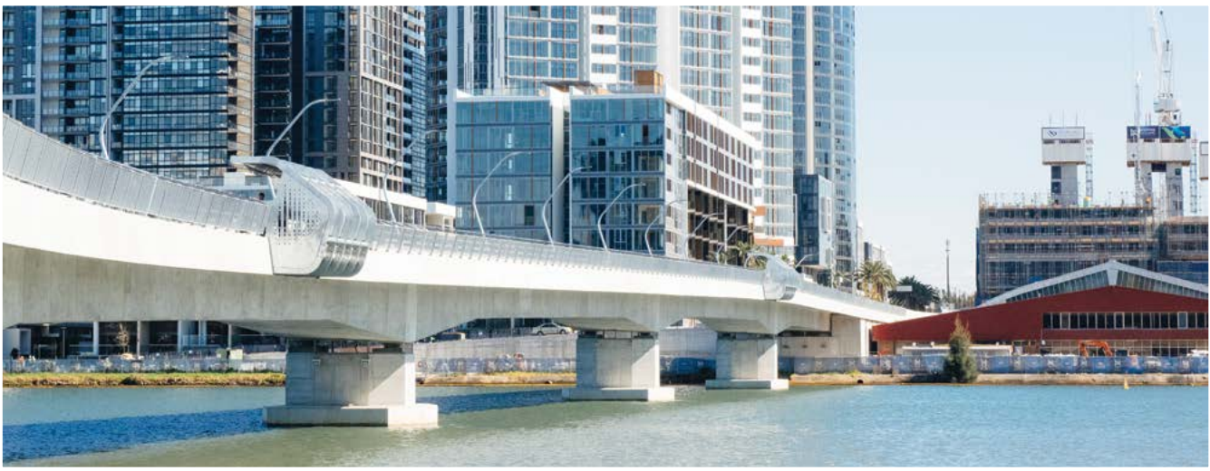
Below MP Fire Pty Ltd provided international standard passive fire protection services for the Bennelong Bridge.