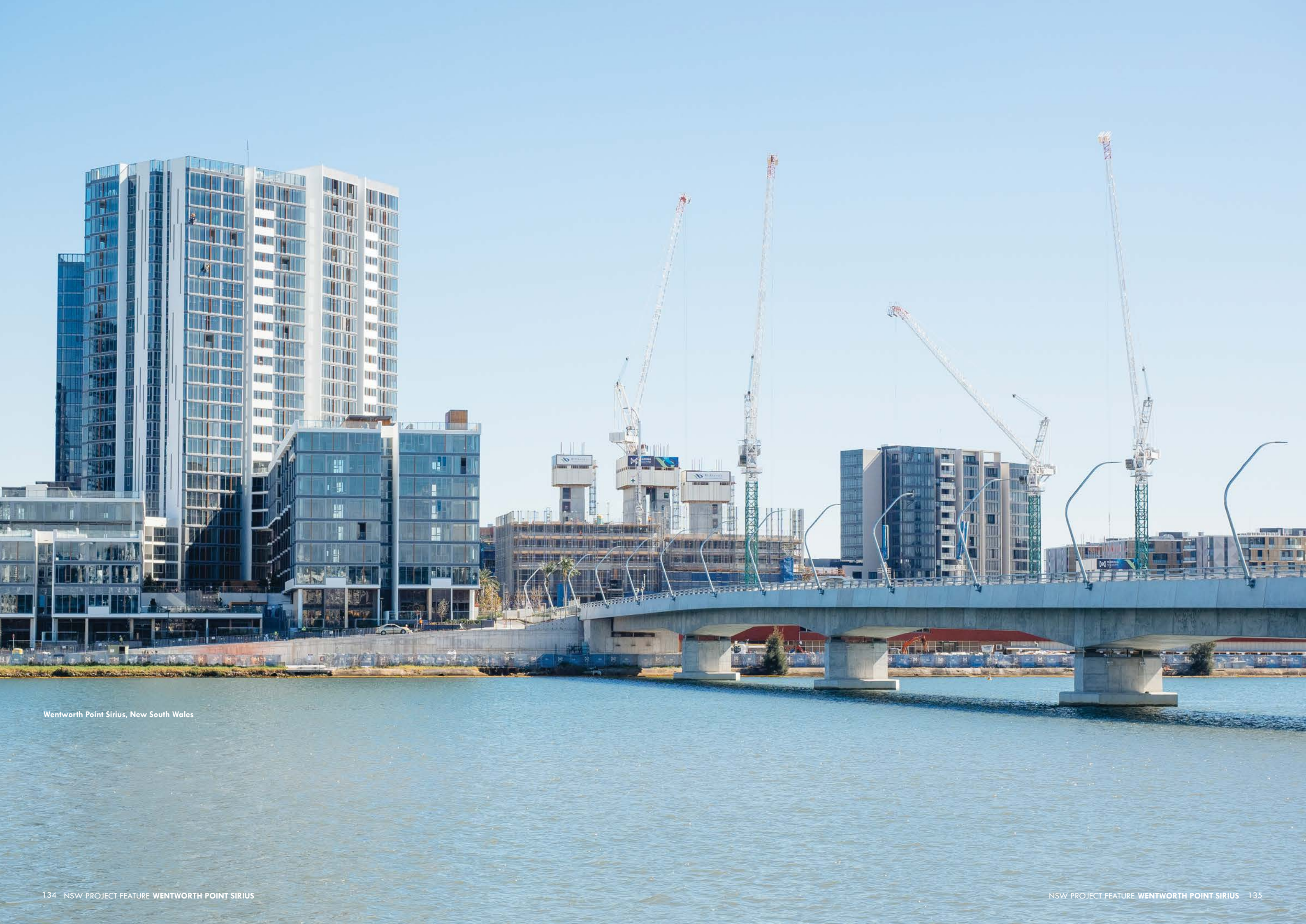
Wentworth Point Sirius, New South Wales