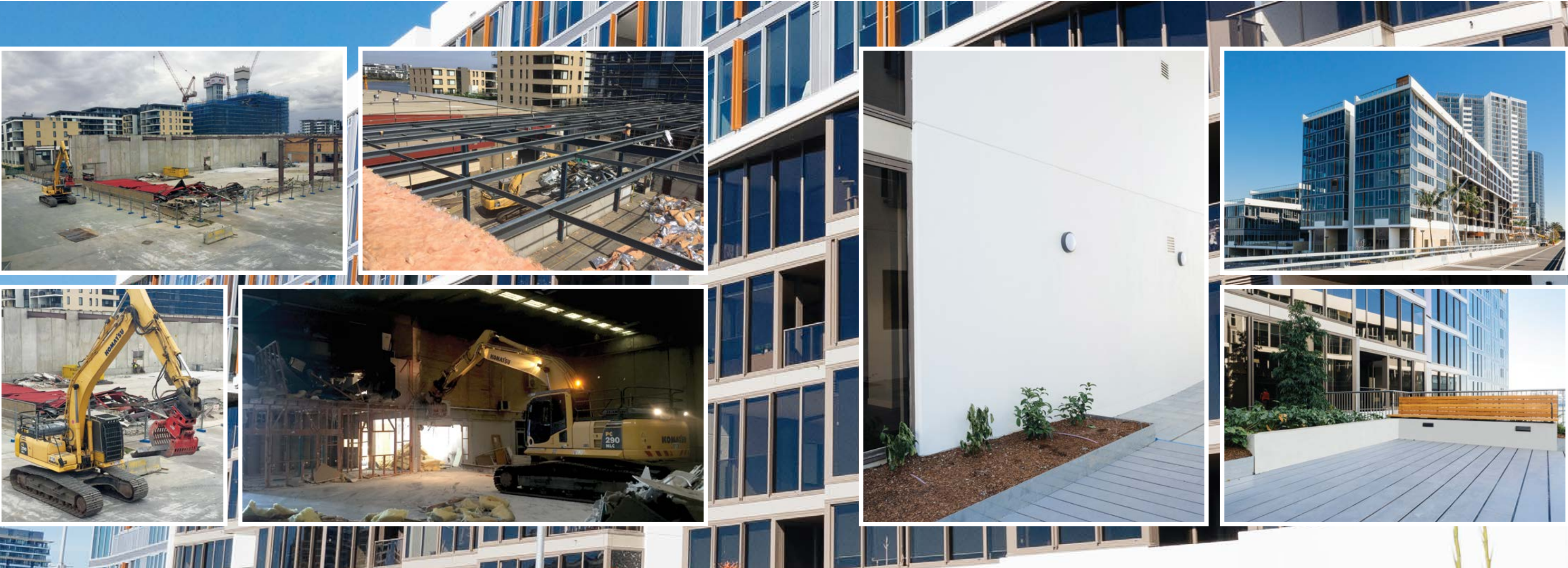
Below Sydney Renderers & Painters applied acrylic render and polymer modified render to prefabricated walls on the project.

Drumderg Services Pty Ltd has a proven track record in successfully delivering civil, demolition, asbestos removal, onsite recycling, crushing and screening services. The company has worked with Billbergia on a number of its Wentworth Point projects in preparing sites for construction, the latest being the Sirius apartments building.