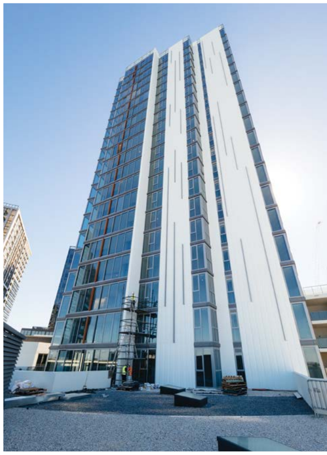
Below Golden Eagle Painting Pty Ltd used multiple teams to complete painting, patching and rendering works to 355 apartments.

For more information contact MP Fire Pty Ltd , 237 Peats Ferry Road, Hornsby NSW 2077, mobile (Peter) 0415 337 838, mobile (Mauro) 0452 177 066, email mp@mpfire.com.au, website www.mpfire.com.au