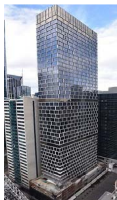
183-189 A'Beckett Street Melbourne VIC