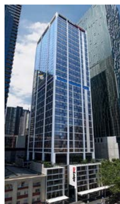
478-488 Elizabeth Street Melbourne VIC