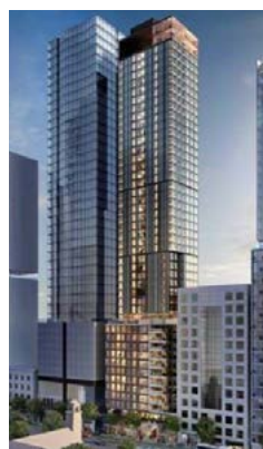
293 La Trobe Street Melbourne VIC