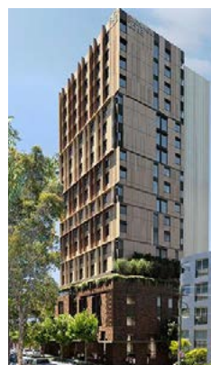
Gibbons Street Redfern NSW