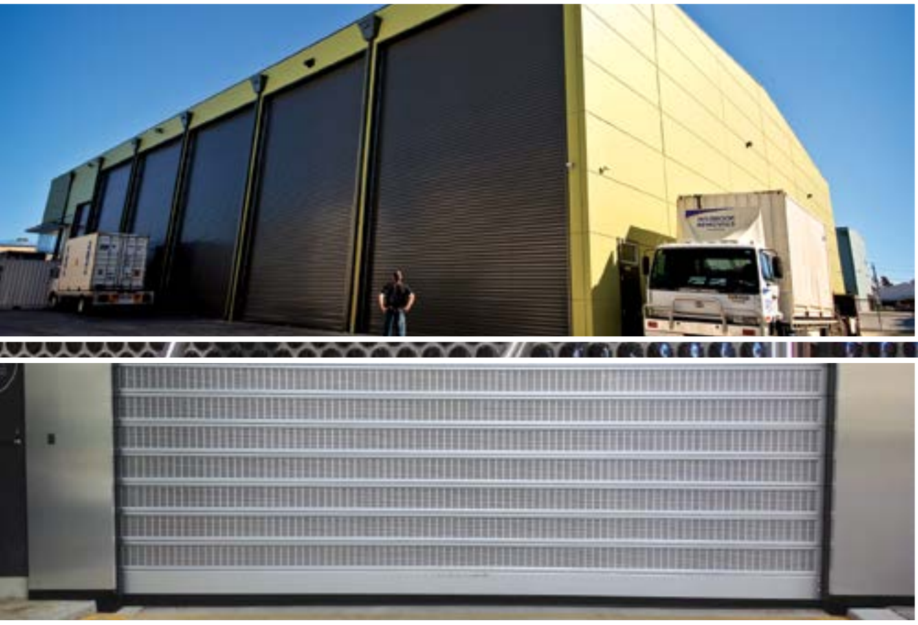
Below Capital Doorworks installed the security shutters for the carparks on Wayfarer.