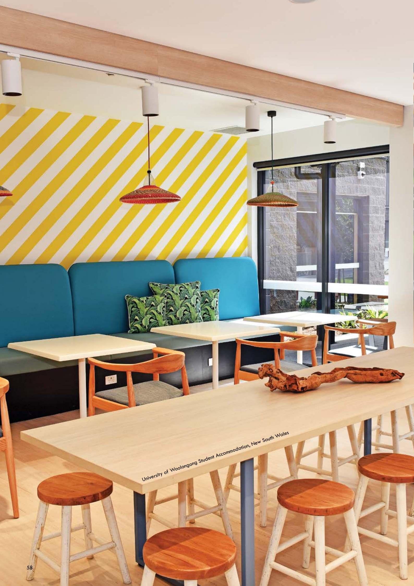
University of Wollongong Student Accommodation, New South Wales