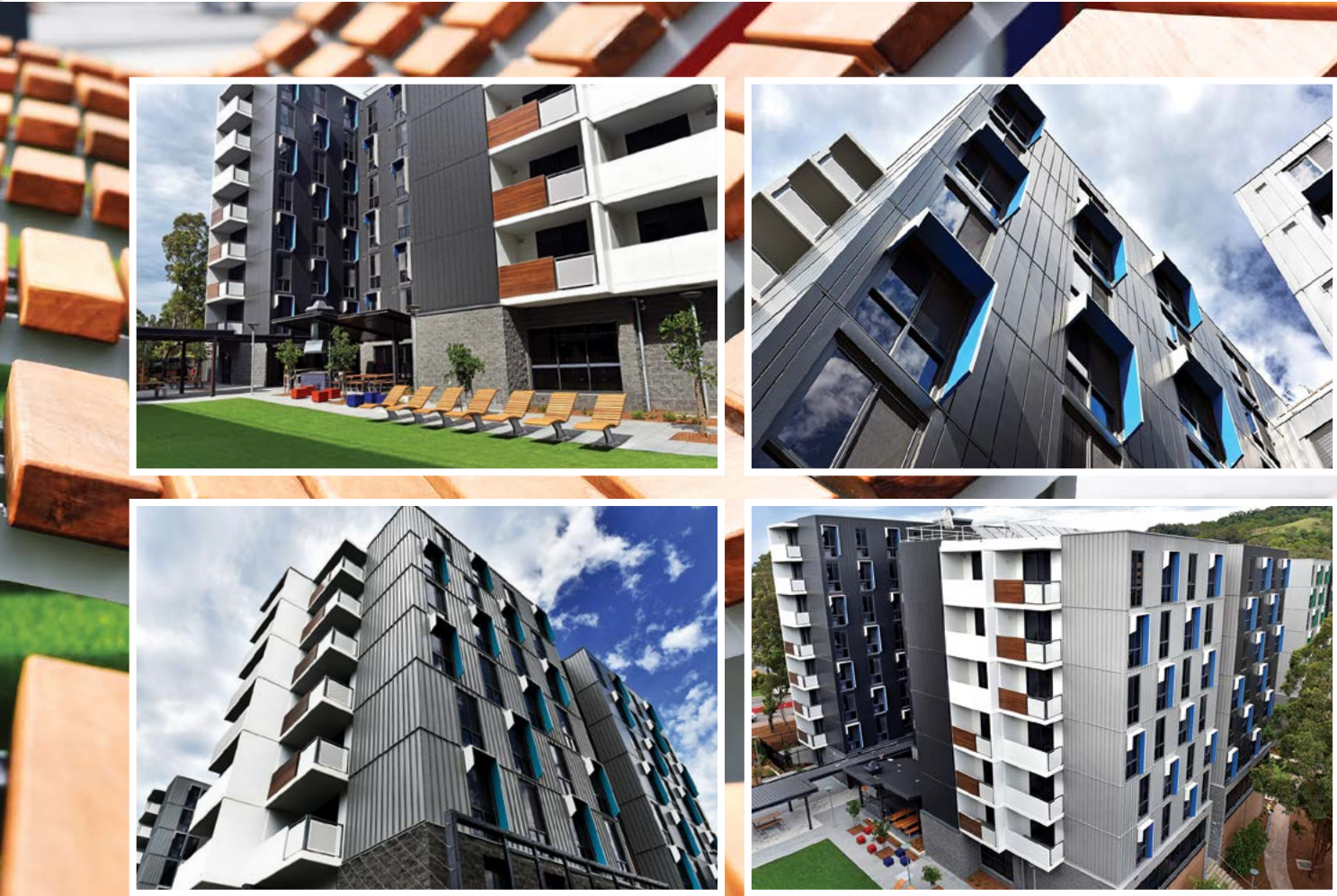
Below Industry Cladding & Roofing installed the external cladding façade, provided by Archclad, for the project.

For the University of Wollongong Student Accommodation, the company supplied and installed metal cladding consisting of Solid Aluminium PVDF Cladding. Archclad Express™ Panels and Archclad Cliptray 48™ Systems were selected by Hutchinson Builders to the entire external façade. Aluminium sunshades were also installed onto specific windows. All these materials were tested and engineered by Archclad™ to meet the specific project requirements.