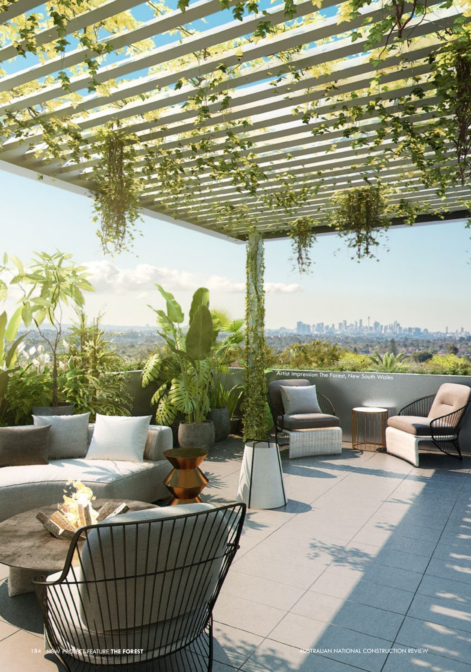
Artist impression The Forest, New South Wales