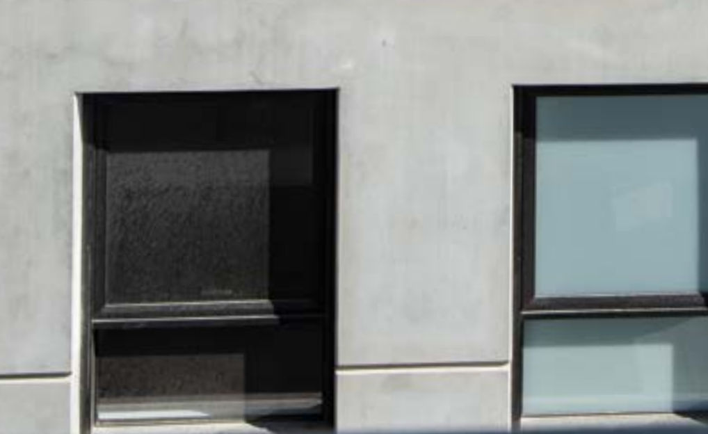
Concrete equalisation to fair faced appearance.