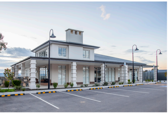
Below Holland Brothers installed the sewage/ stormwater drainage systems, hot and cold water reticulation and gas supply to all 92 villas and clubhouse.