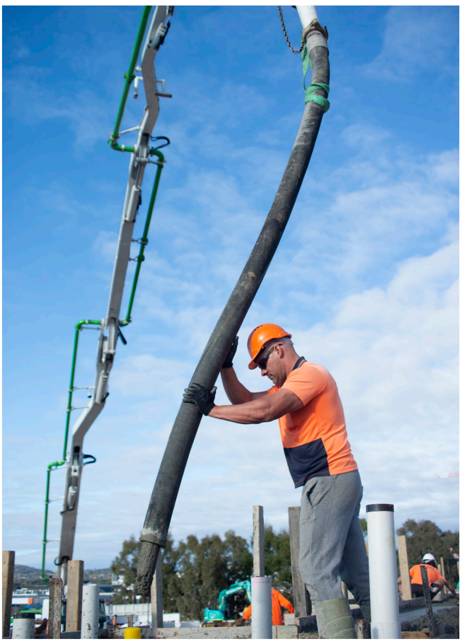
Below ACT Concreting provided the concrete supply and placement for The Aerie's external works, residences and common areas.