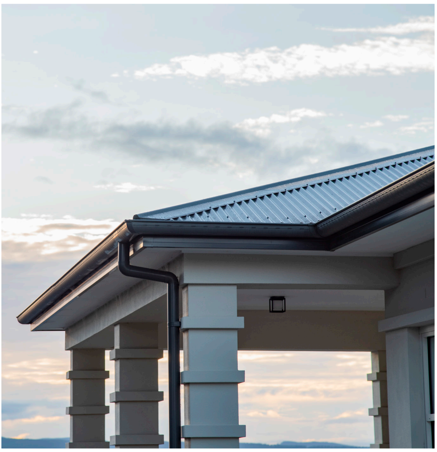
Below Moraschi Roofing installed over 16,000m 2 of roofing to the 92 villas and clubhouse at The Aerie.

ACT Concreting provides a quality comprehensive service of concrete supply and placement for all domestic and large scale residential projects across the Canberra region.