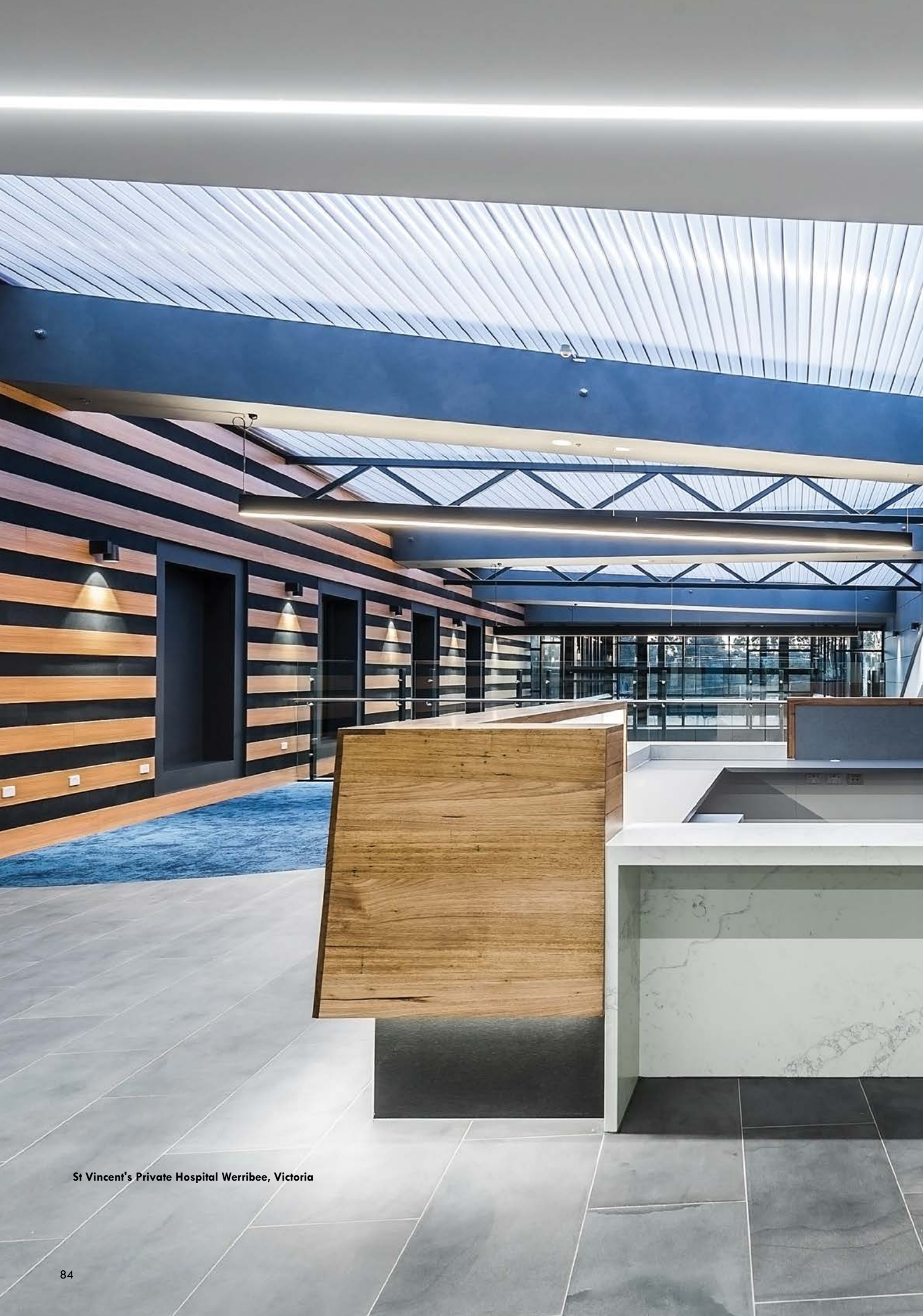
St Vincent's Private Hospital Werribee, Victoria