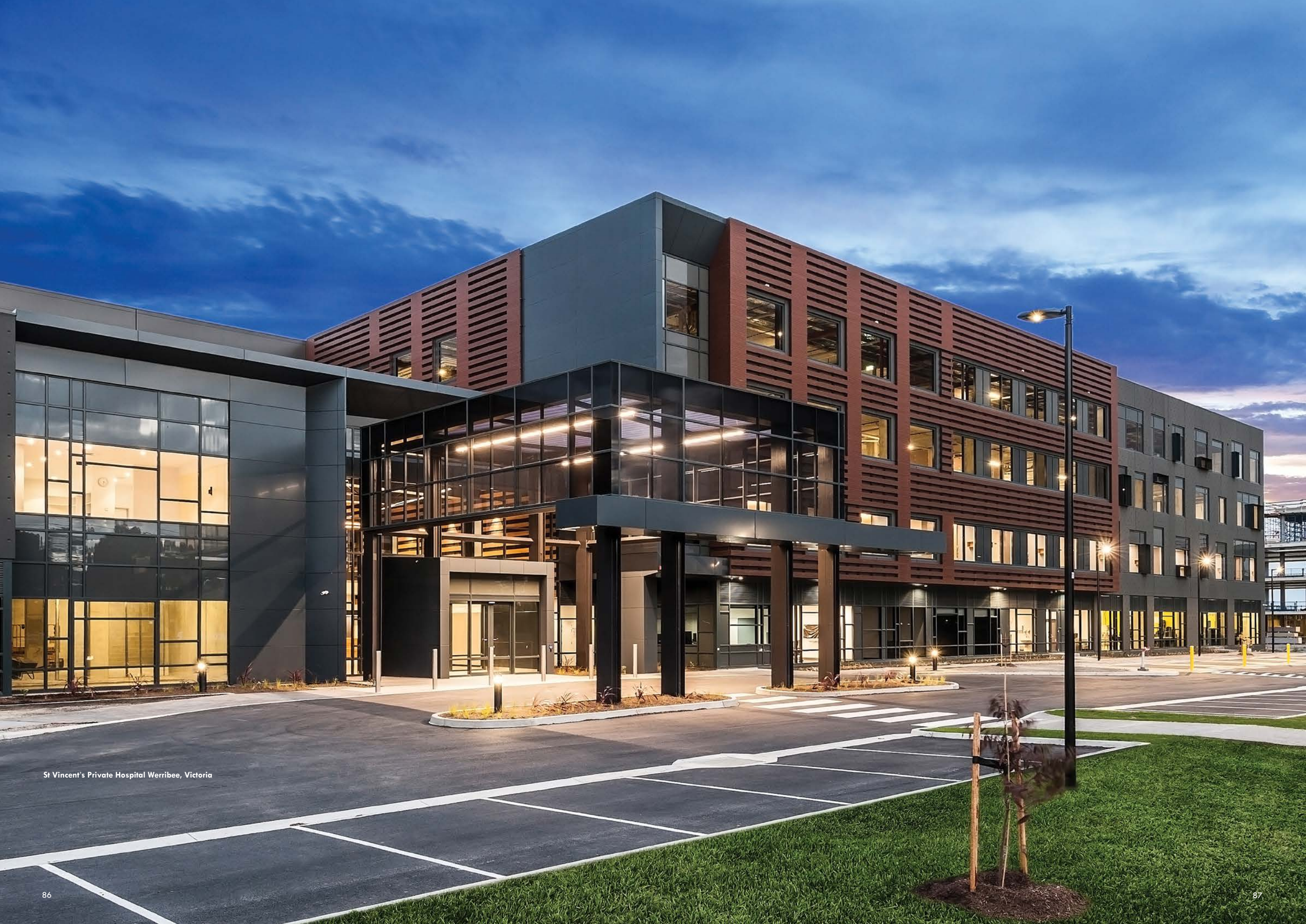
St Vincent's Private Hospital Werribee, Victoria