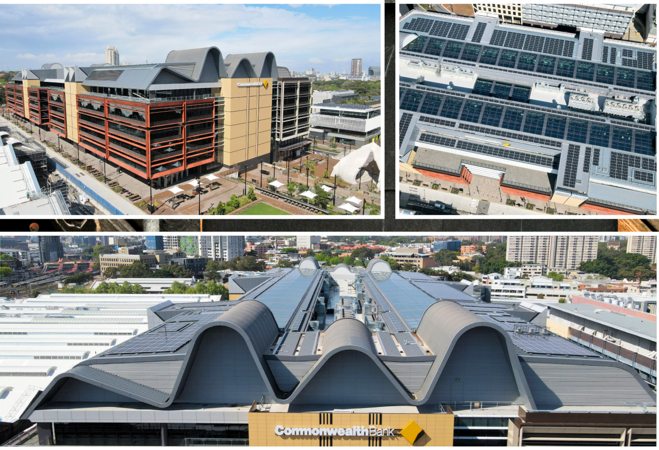
Below Red 8 Roofing installed new corrugated roof sheets, flashings, insulation, and more for the South Eveleigh project.