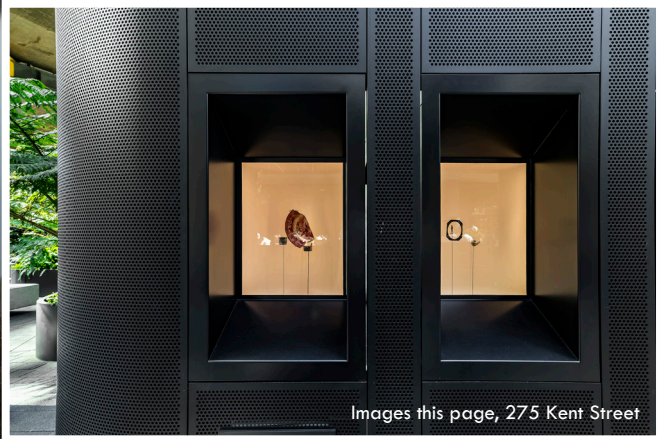
Images this page, 275 Kent Street