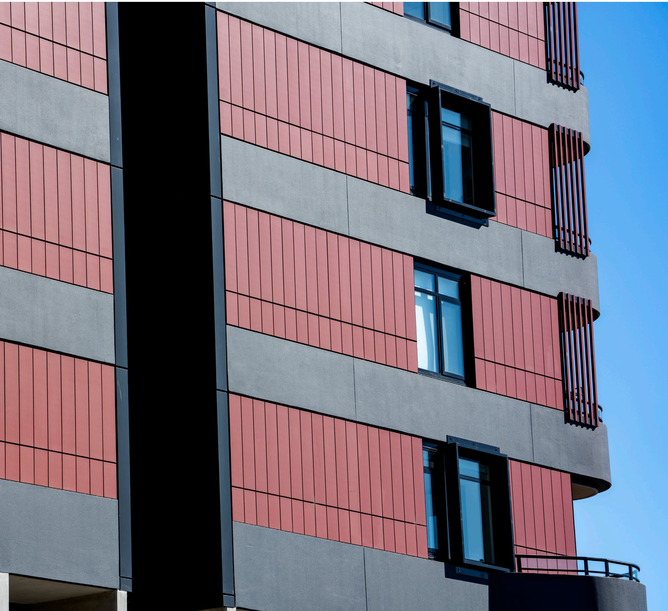
Below Australian Cladding Specialists installed the terracotta and aluminium cladding at the Sanctuary.

Australian Cladding Specialists (ACS) were appointed under a design and build contract to supply and install external façades to Stage 1, including terracotta and aluminium cladding to all three towers in the complex.