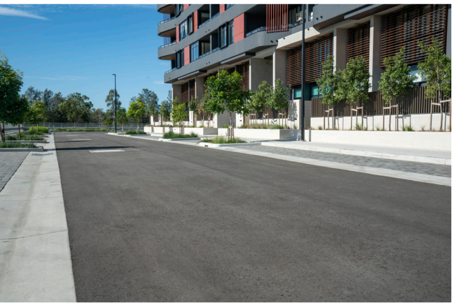
Below CHERIO Civil Works completed the external civil works including kerbs, parking bays, footpaths and roadways.