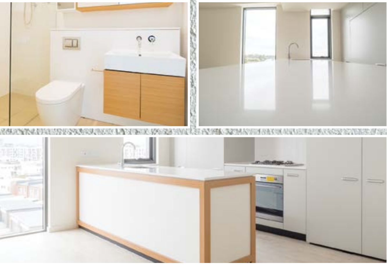
Below Stoneworx provided the stone and tiling for Royal Shores Ermington.