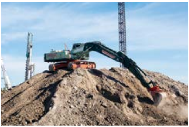
Below Ghossayn Group provided the bulk excavation works for Royal Shores Ermington.