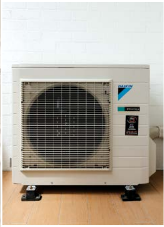
Below J&J Metro Air Conditioning installed a Daikin split system air conditioning unit with the outdoor unit on the balcony of each apartment.

For more information contact Ghossayn Group, 25-27 Governor Macquarie Drive, Chipping Norton NSW 2170, phone 02 9755 2777, fax 02 9755 2005, email ghossayn@ghossayn.com.au, website www.ghossayn.com.au