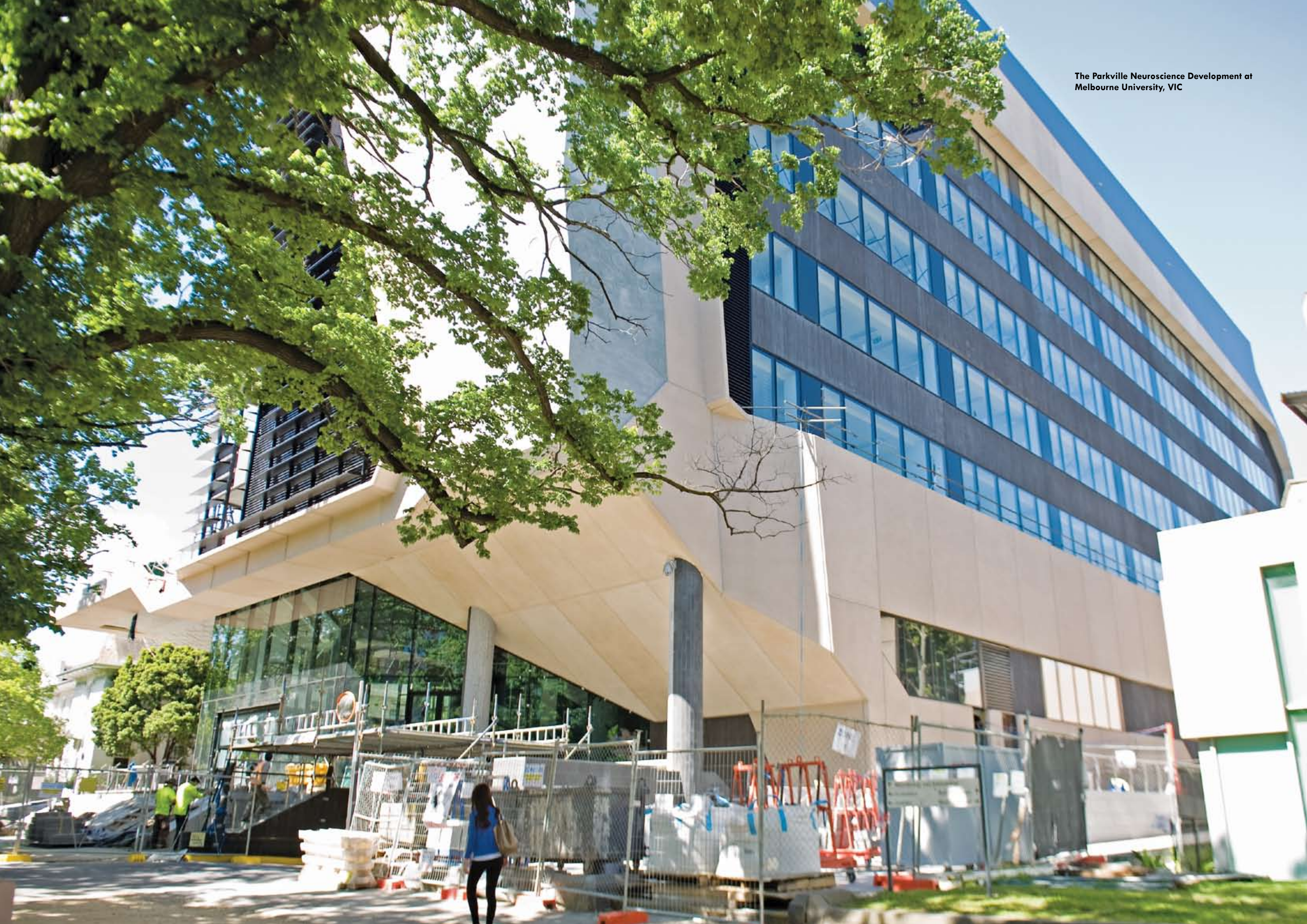
The Parkville Neuroscience Development at Melbourne University, VIC