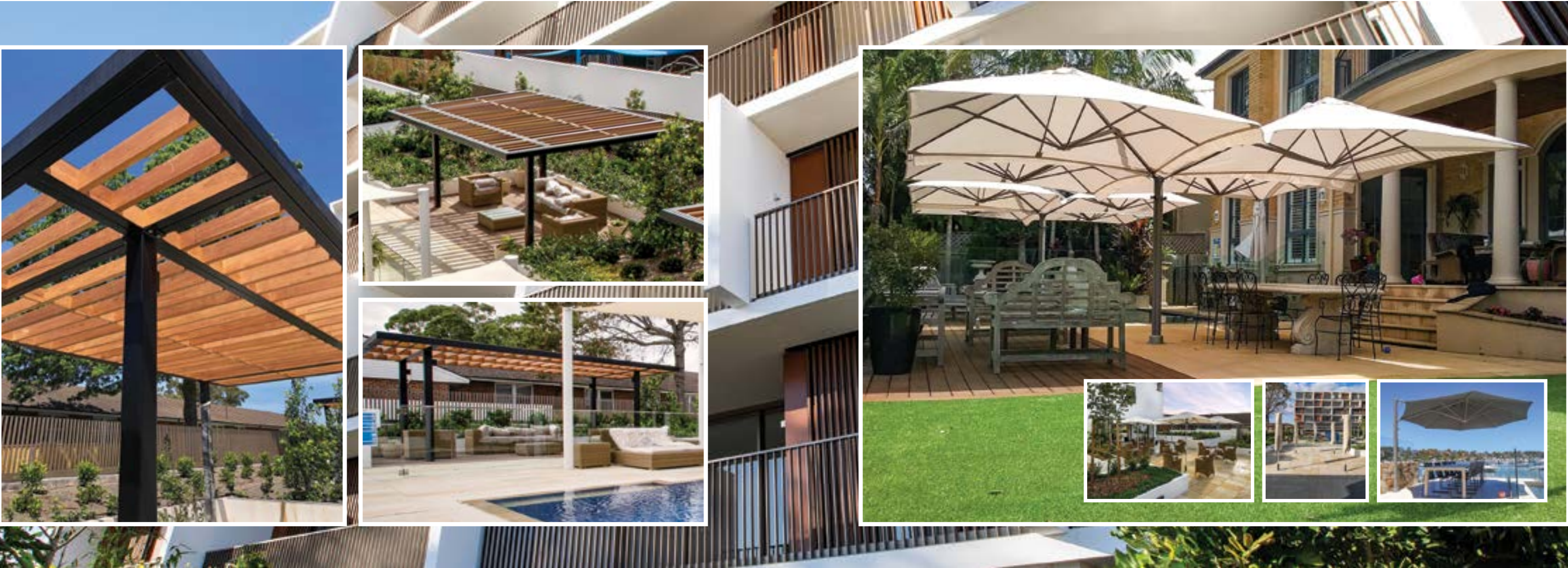
Below Sydney Shade supplied six, 2m square SU2 Café Market Umbrellas for Palisade Miranda’s outdoor terrace areas.

As one of Sydney’s leading carpentry companies, Mulberry Construction Group bring designs to life, while delivering quality bespoke design solutions for residential and commercial developments, including the Palisade Miranda.