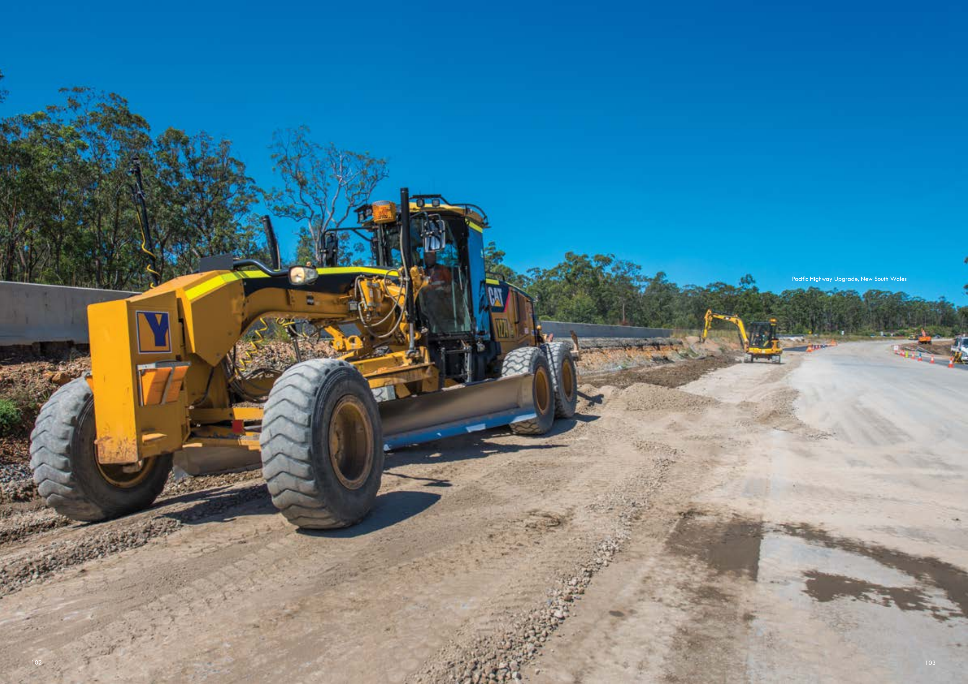
Pacific Highway Upgrade, New South Wales