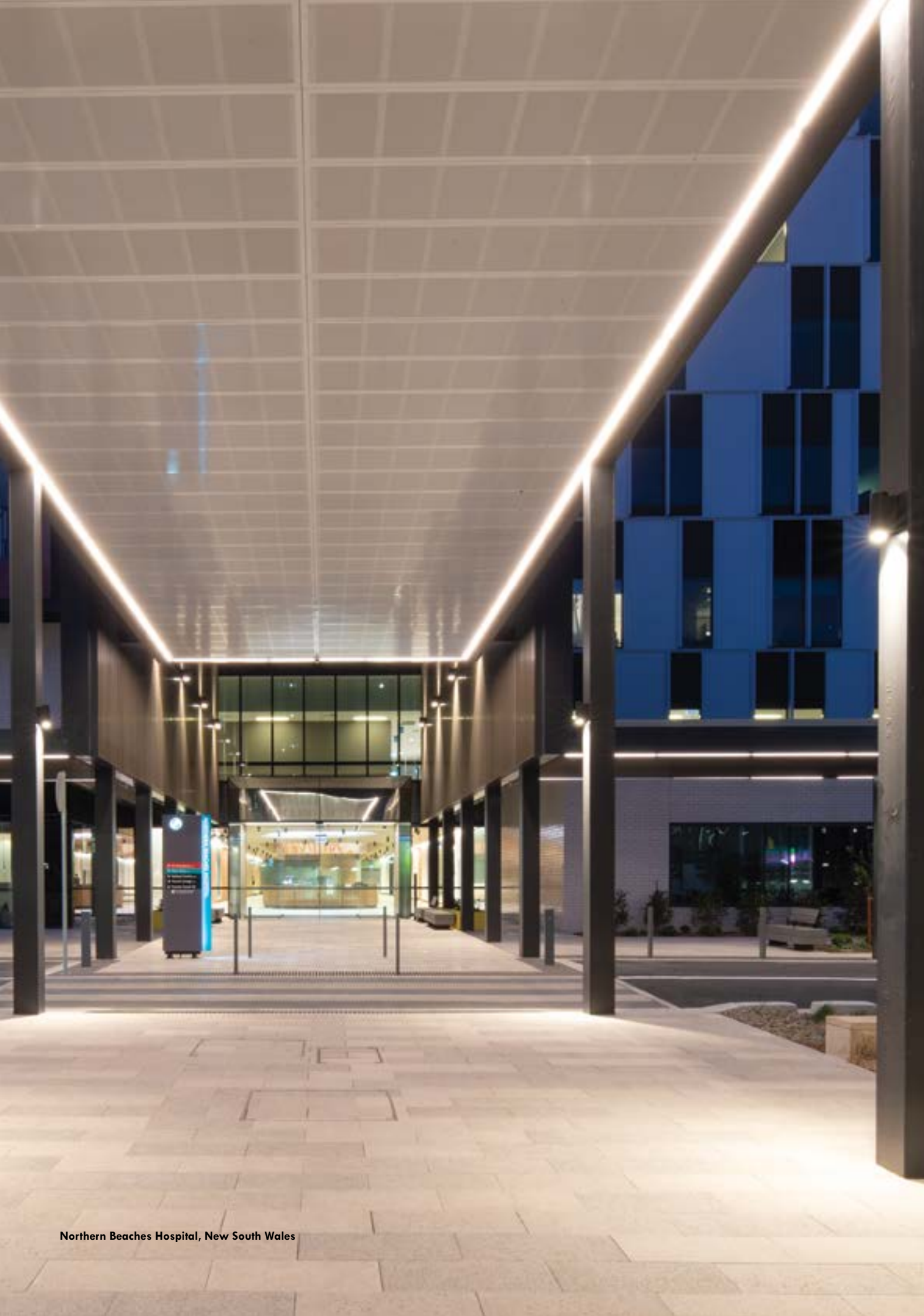
Northern Beaches Hospital, New South Wales

Below Peter Kelly Flooring laid the vinyl for the wards and surgeries, as well as the carpeting for admin and fitted Bolon feature walls.