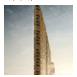
Fortitude Valley Brisbane