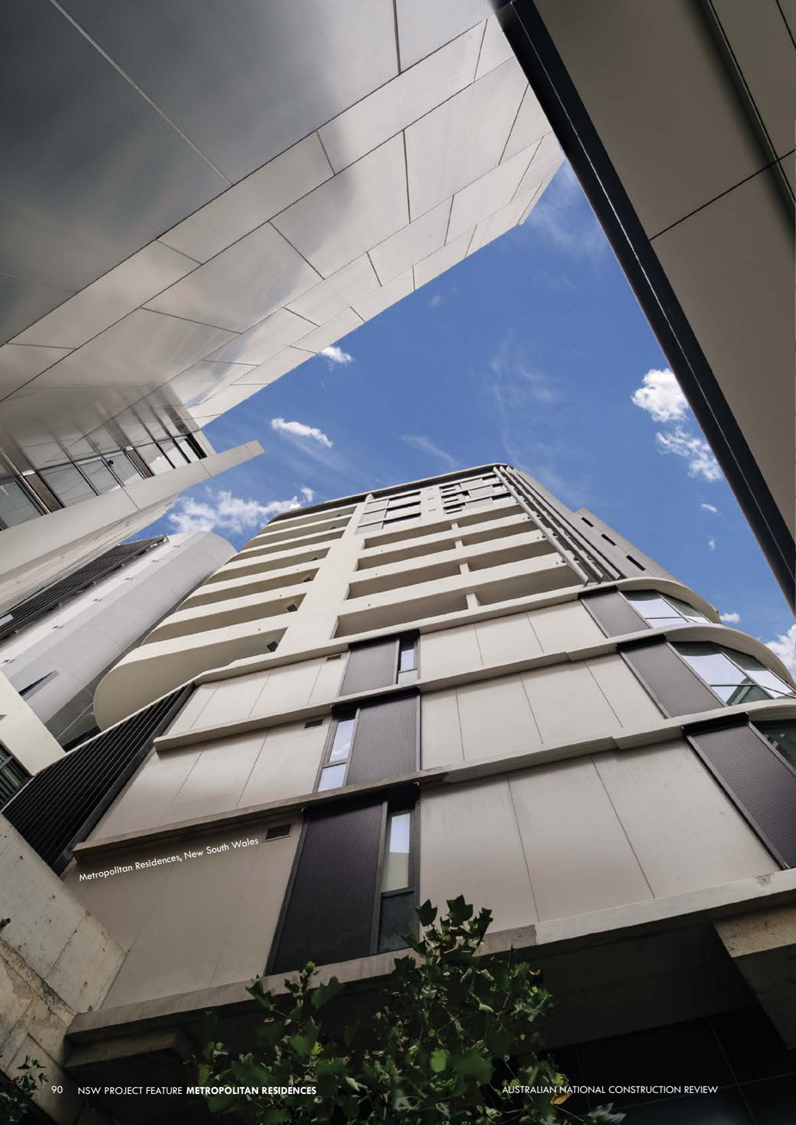
Metropolitan Residences, New South Wales

Below Ultimate Flooring provided and installed the timber flooring and decking for the Metropolitan Residences.