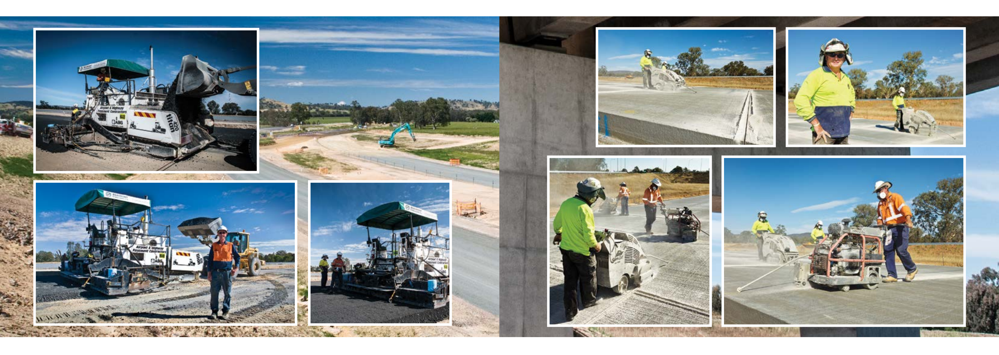
Below Beaumont Stabilising's involvement in the project was to paver place the select material zone, at an overall thickness of 300mm, in two layers of 150mm.

Having been contracting to the road construction industry since 1986, Beaumont Stabilising were an obvious choice to work on the Holbrook Bypass project. Operating a fleet of eight, German-made, ABG road base paving machines, which distribute material in layers from 3.5 metres to 12 metres wide, Beaumont Stabilising are well known for their accurate level results and high standards of work. Also included in their fleet are two Volvo front-end loaders—ideal for loading the road-base material into the pavers when the use of trucks with dog trailers is impractical or uneconomical. Having worked within the civil contracting industry for 26 years, Beaumont Stabilising's experience focuses on major and arterial road upgrades, airport runways and road tunnels. They have been involved in many significant projects such as Nagambie Bypass (2012), Coal Connect 'Missing Link' Rail project (2011), Townsville Port Access Road (2011), Avalon Airport (2010) and Caboolture Bypass (2009).