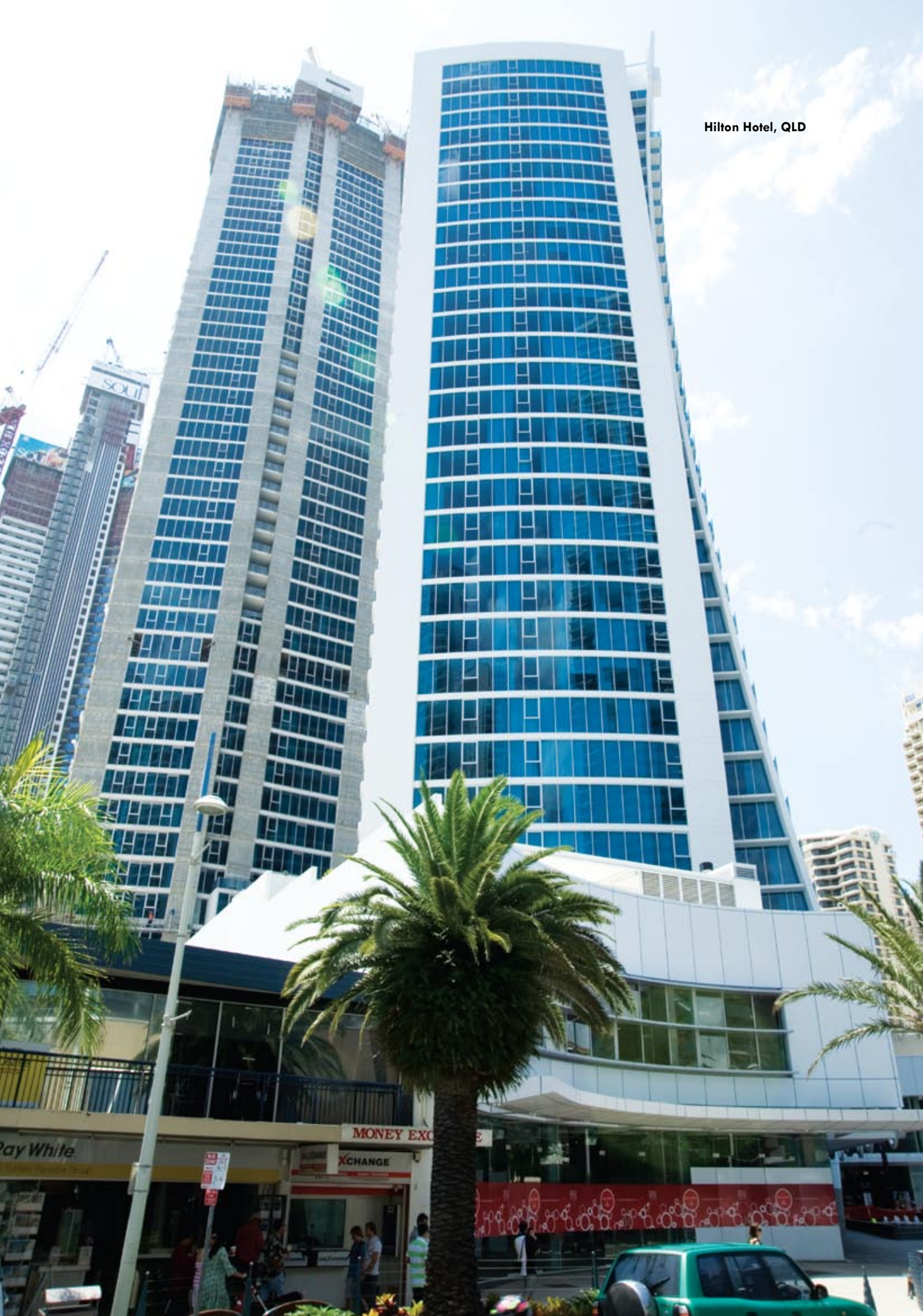
Hilton Hotel, QLD