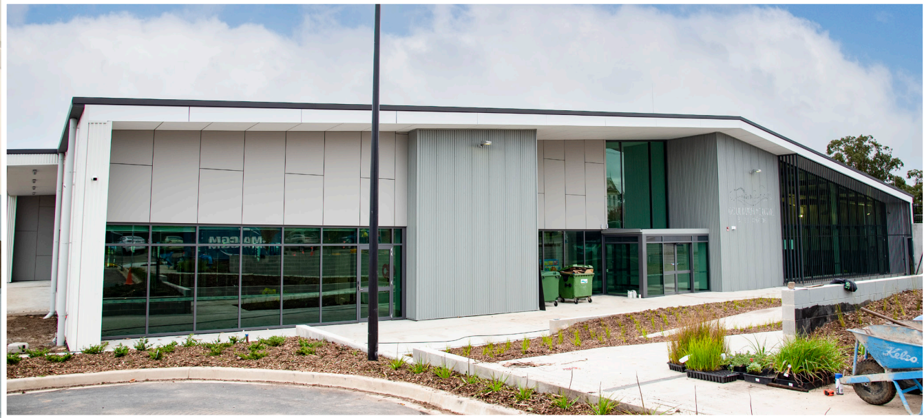
Below Welkin supplied and installed the external cladding and screens to the Goulburn Aquatic Centre project.