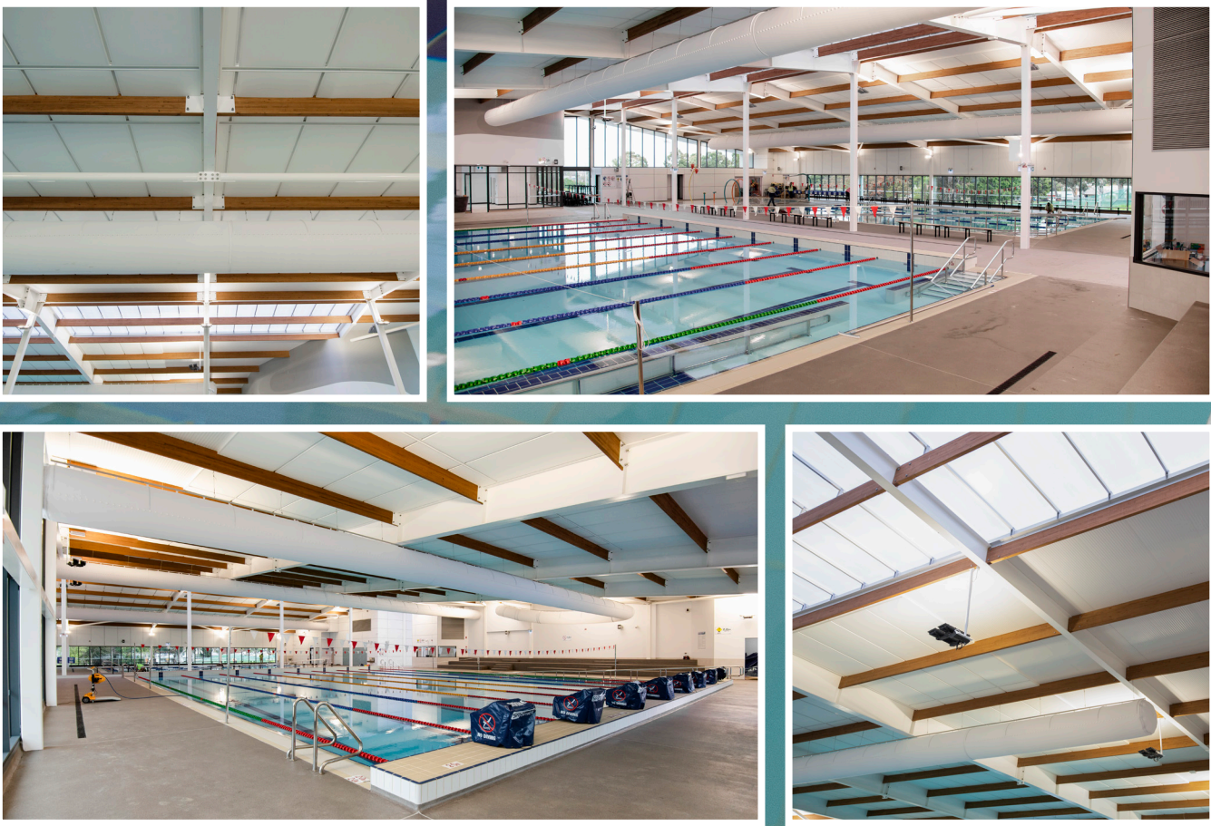
Below XLam manufactured and supplied a highly sustainable (GLT) glue laminated timber for the roof structure of the main pool hall.