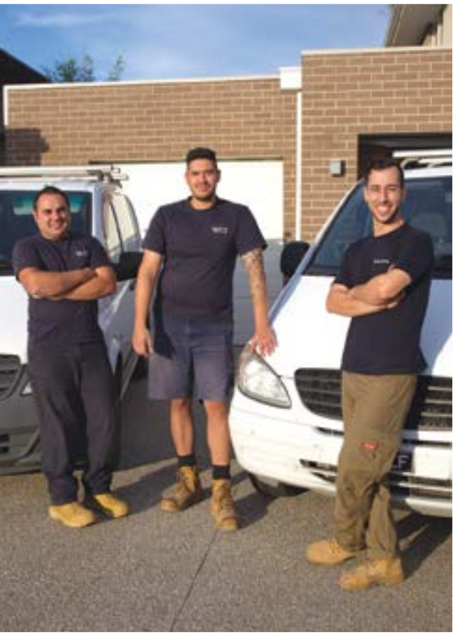
Below No Fuss Construction Fixings provided the site supplies for Epworth Richmond Lee Wing.

Service and speed is what No Fuss Construction Fixings prides itself on – a family-based business that has been operating throughout Melbourne and Victoria for over 15 years. With three full time drivers, no job is too big or small for this one stop supplier for construction companies. This includes working with Kane Constructions during the Epworth Richmond Lee Wing.