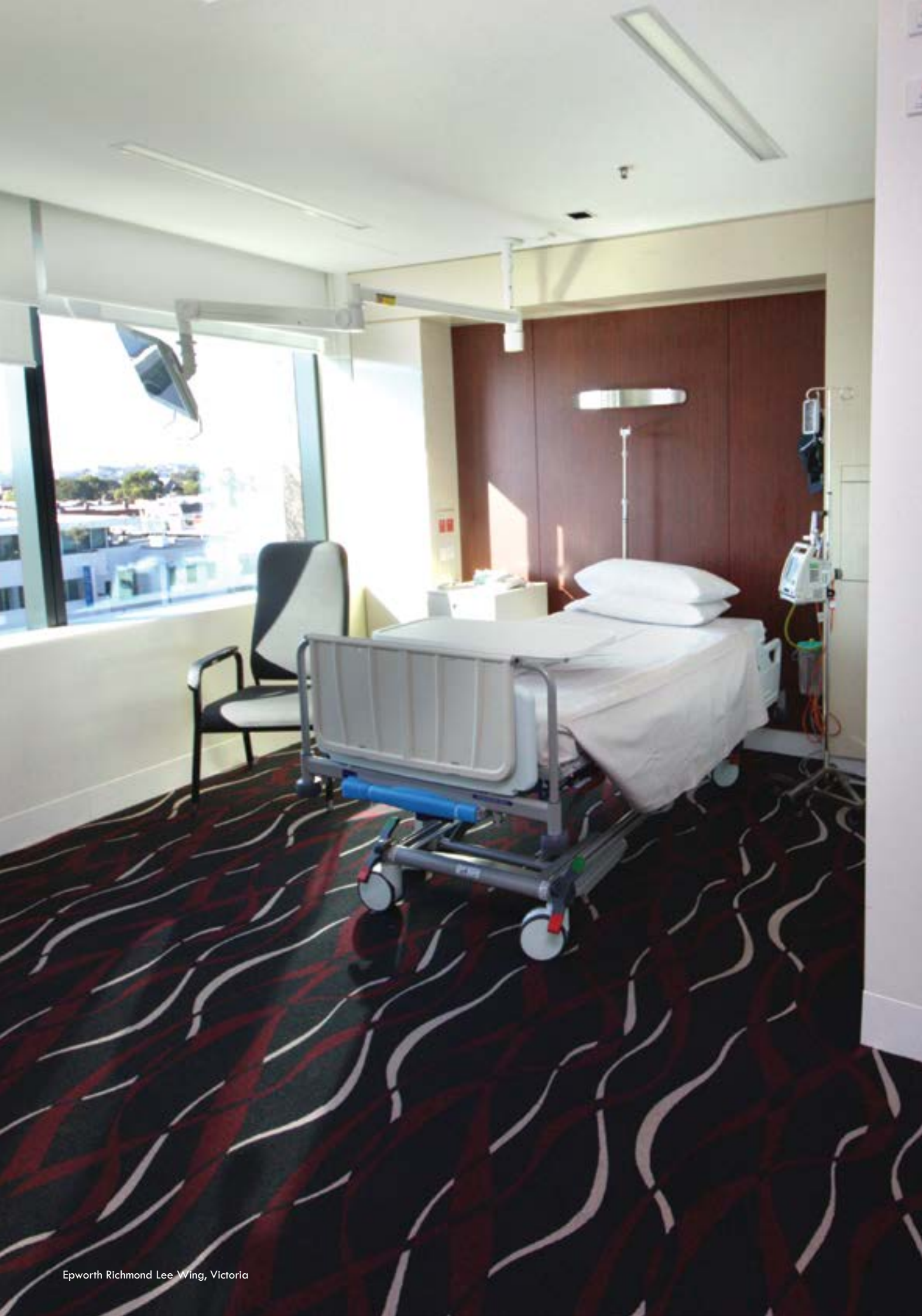
Epworth Richmond Lee Wing, Victoria

Below Ingal Civil Products fitted out the Epworth Richmond Lee Wing's new care park facility.