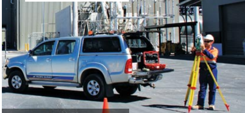
Darkubg Downs Power Station, QLD