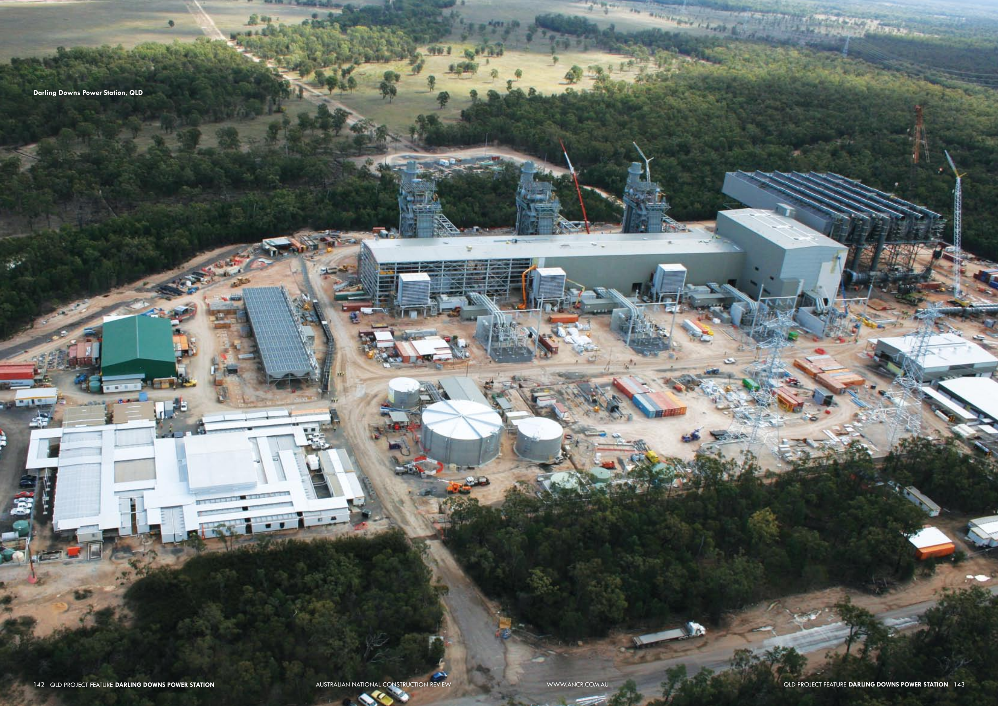
Darling Downs Power Station, QLD