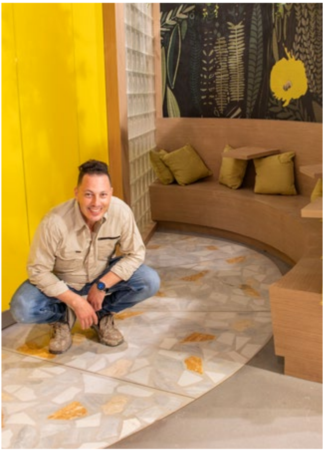
Below Instyle Stone designed and installed the palladiana terrazzo floors to the restaurant and café.