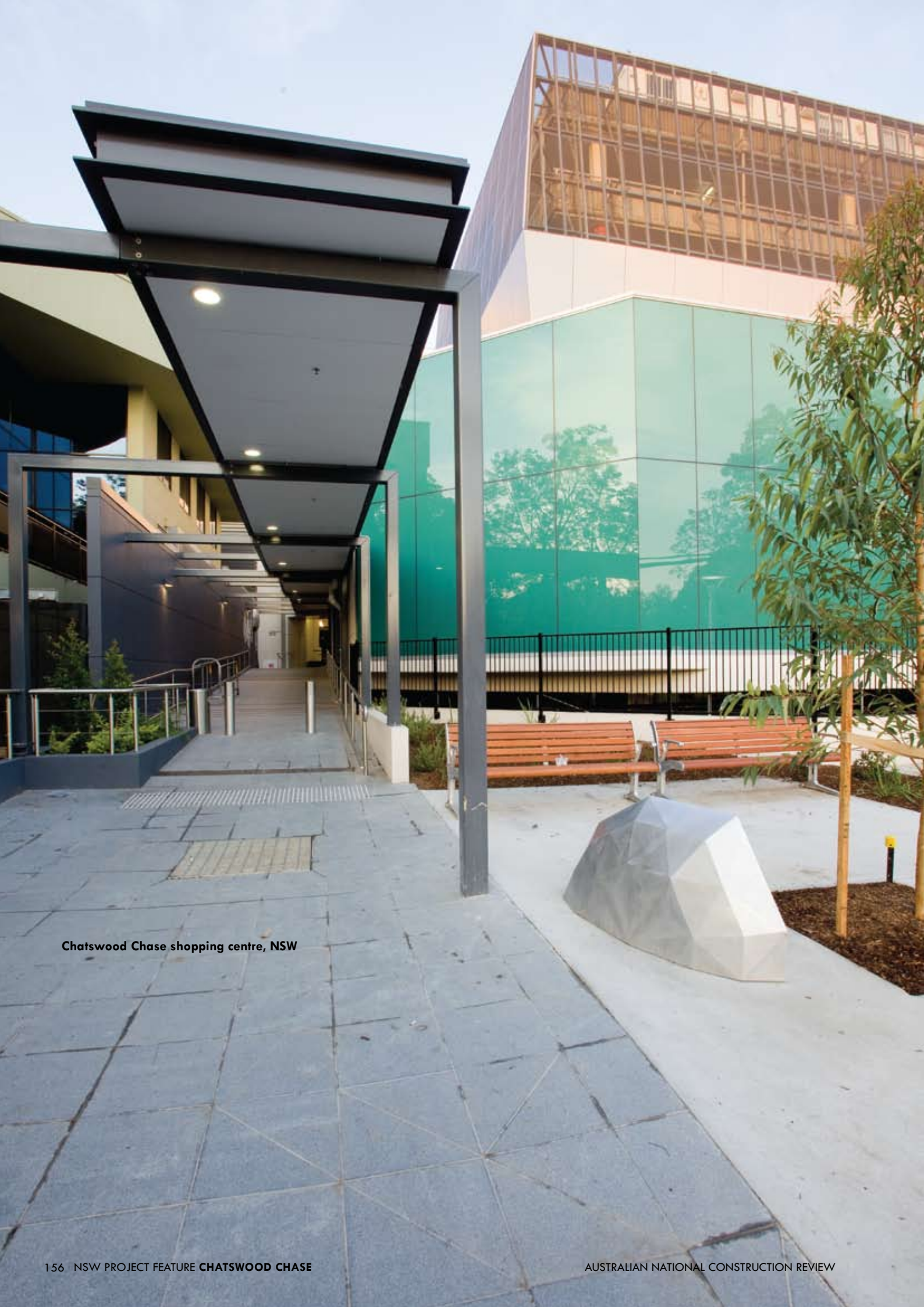
Chatswood Chase shopping centre, NSW