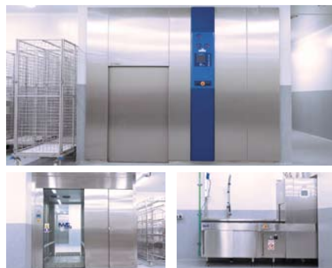
Below main Steriliser Left Rack washer Right Automated bottle washer