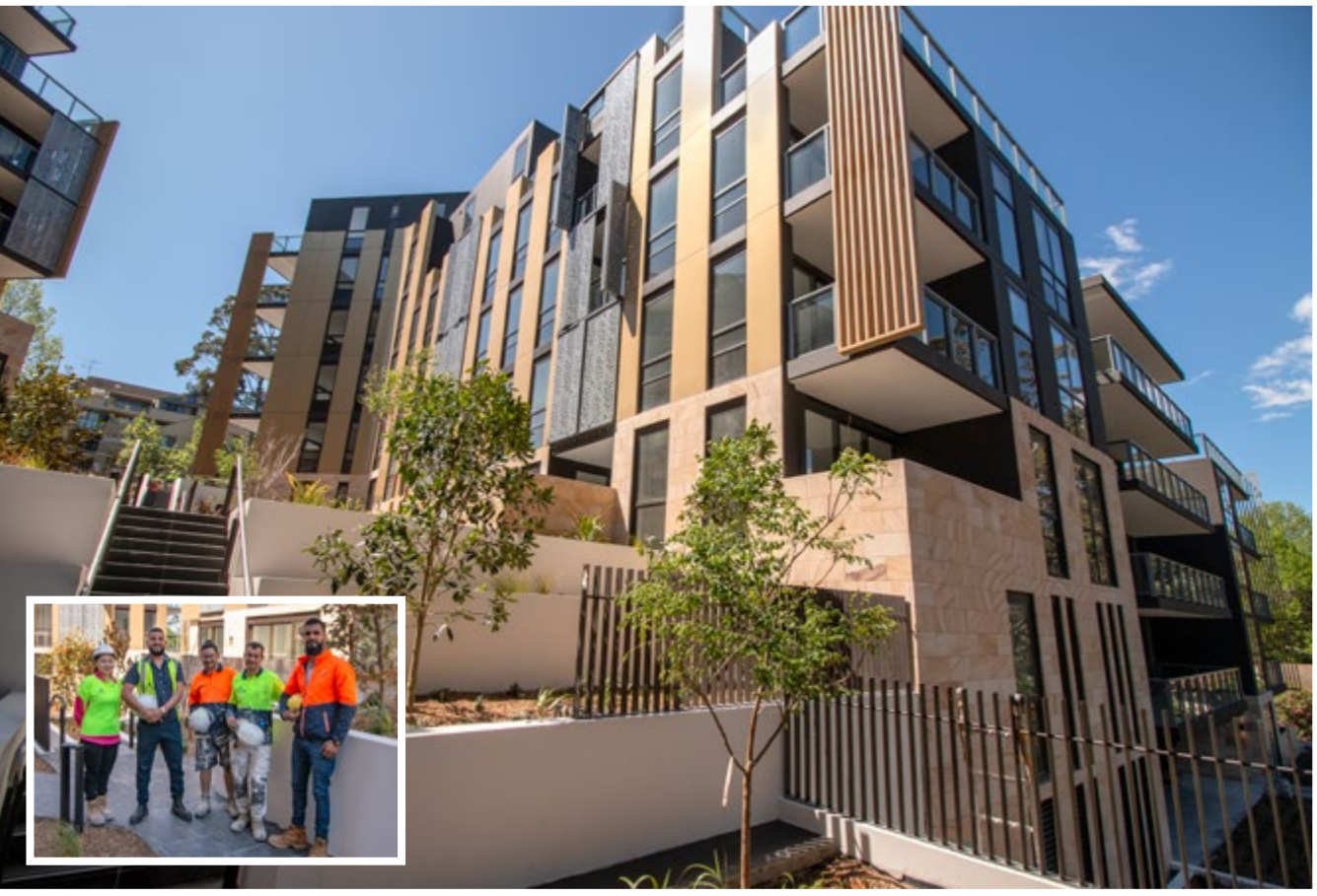
Below D&J Marble and Granite fabricated and installed the natural stone benchtops and splashbacks.

Set to become a new landmark on Sydney’s North Shore, the Cascade Gardens boutique residential development has been described as a ‘gem in the north.’ The three buildings feature striking rendered exteriors complemented by perforated metal screens and louvres to provide a distinctive façade that fosters a sense of community while maintaining privacy and solar protection.