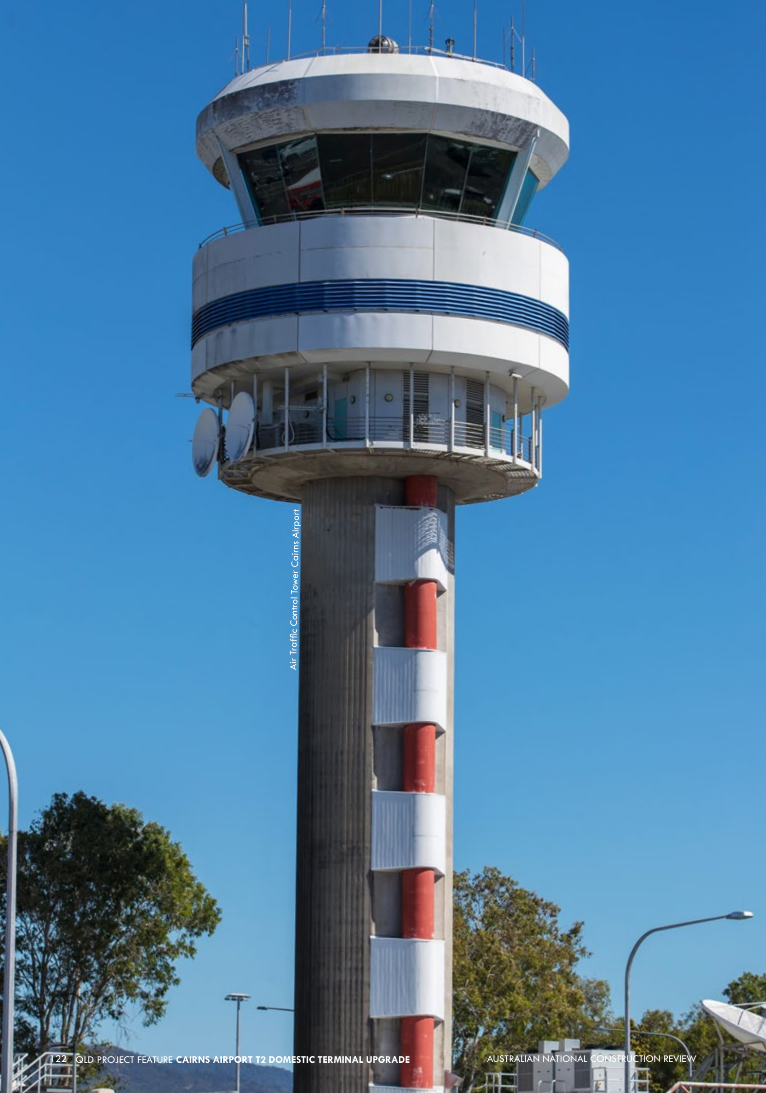
Air Traffic Control Tower Cairns Airport

Below IRT Roofing installed a total of 12,000m 2 of metal roofing throughout the Cairns Airport and T2 upgrade.