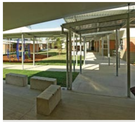
Augusta State School, Bellbird Park

Our name represents the range of services we provide to the construction industry and, without sacrifice to safety and quality, Broad continues to deliver award winning projects across the country.