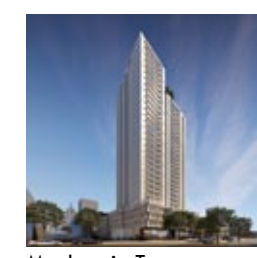
Mackenzie Tower Melbourne CBD

Structural Engineers for the Aerial development would like to congratulate FKP on their landmark project.