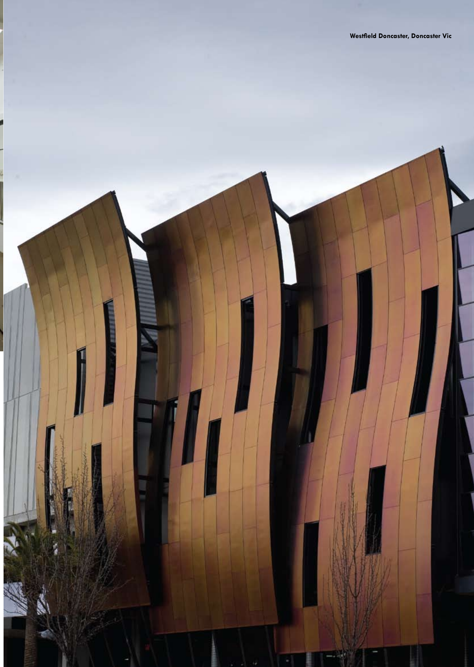
Westfield Doncaster, Doncaster Vic