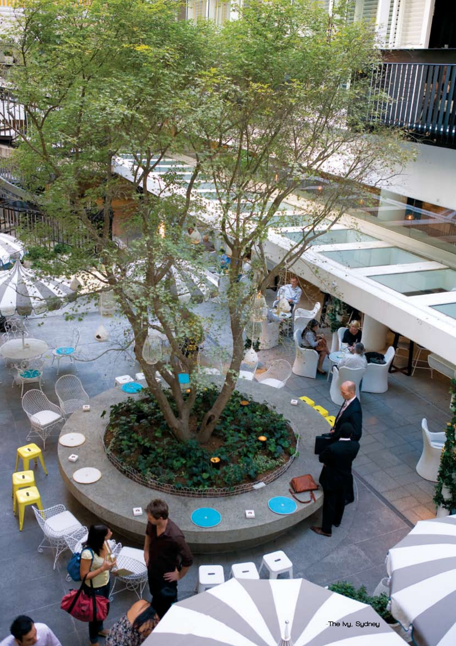
-The Ivy, Sydney