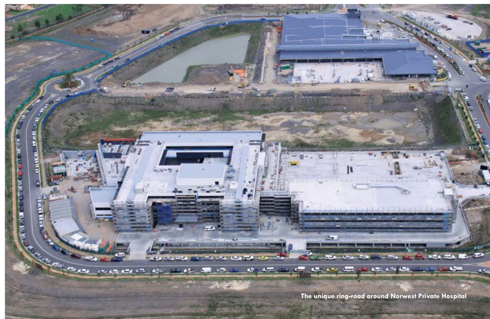
The unique ring-road around Norwest Private Hospital