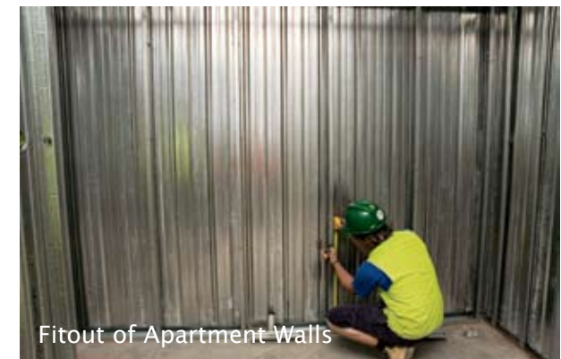
Fitout of Apartment Walls

sible for the design of an extremely soundproof wall, whilst maintaining a thin wall footprint. The final product aims to maximise living space, yet at the same time provide a high level of privacy, fire and sound protection.