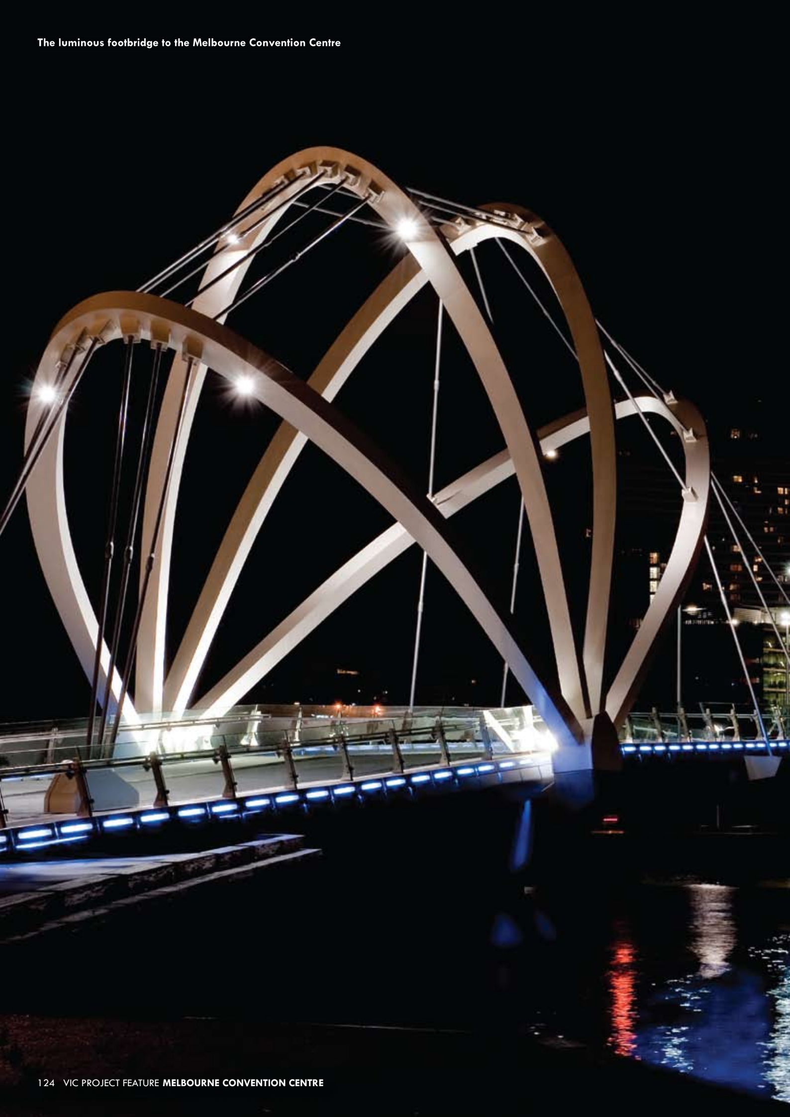
The luminous footbridge to the Melbourne Convention Centre