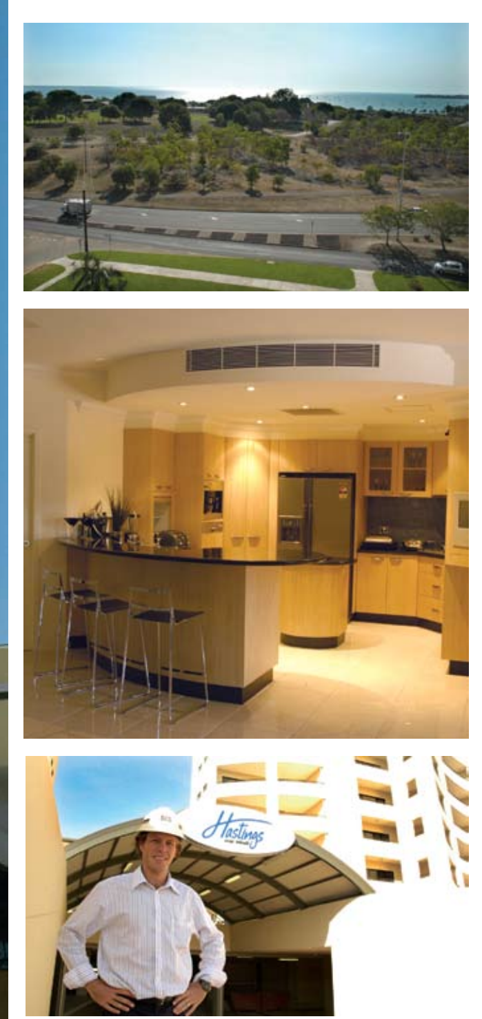
ful venture, providing the opportunity for some exciting new projects in the future.

This was not only an opportunity for Barclay Mowlem to celebrate the completion of a very successful project in Australia's top end, but they are also about to celebrate a new phase in their operations with the company's acquisition by Laing O'Rourke Australia. Laing O'Rourke is the largest privately owned specialist construction and development company in the UK, and their acquisition of Barclay Mowlem is sure to be a very success-