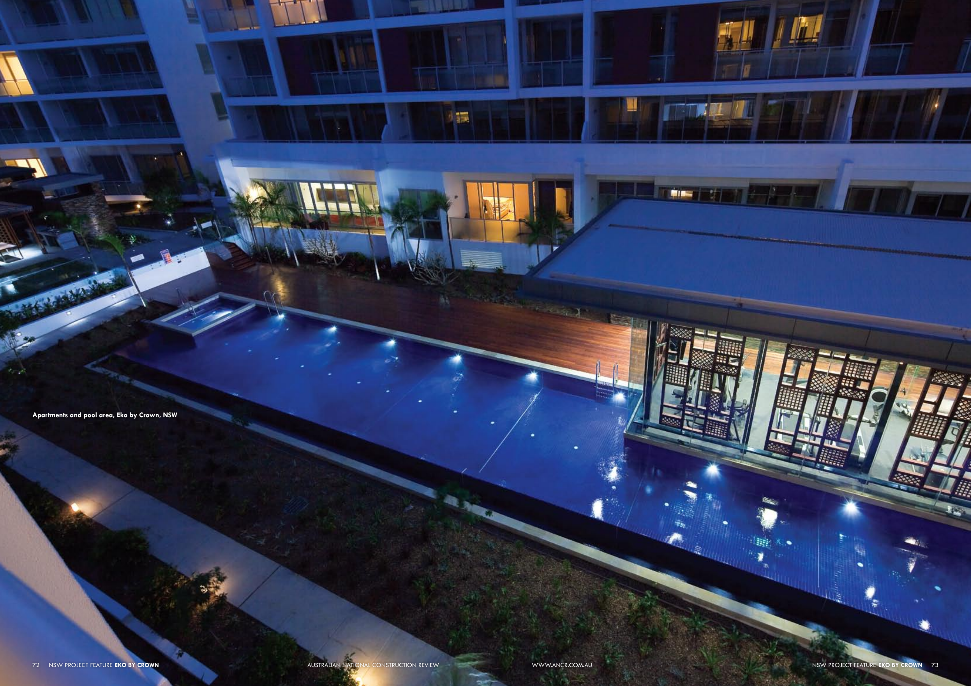
Apartments and pool area, Eko by Crown, NSW