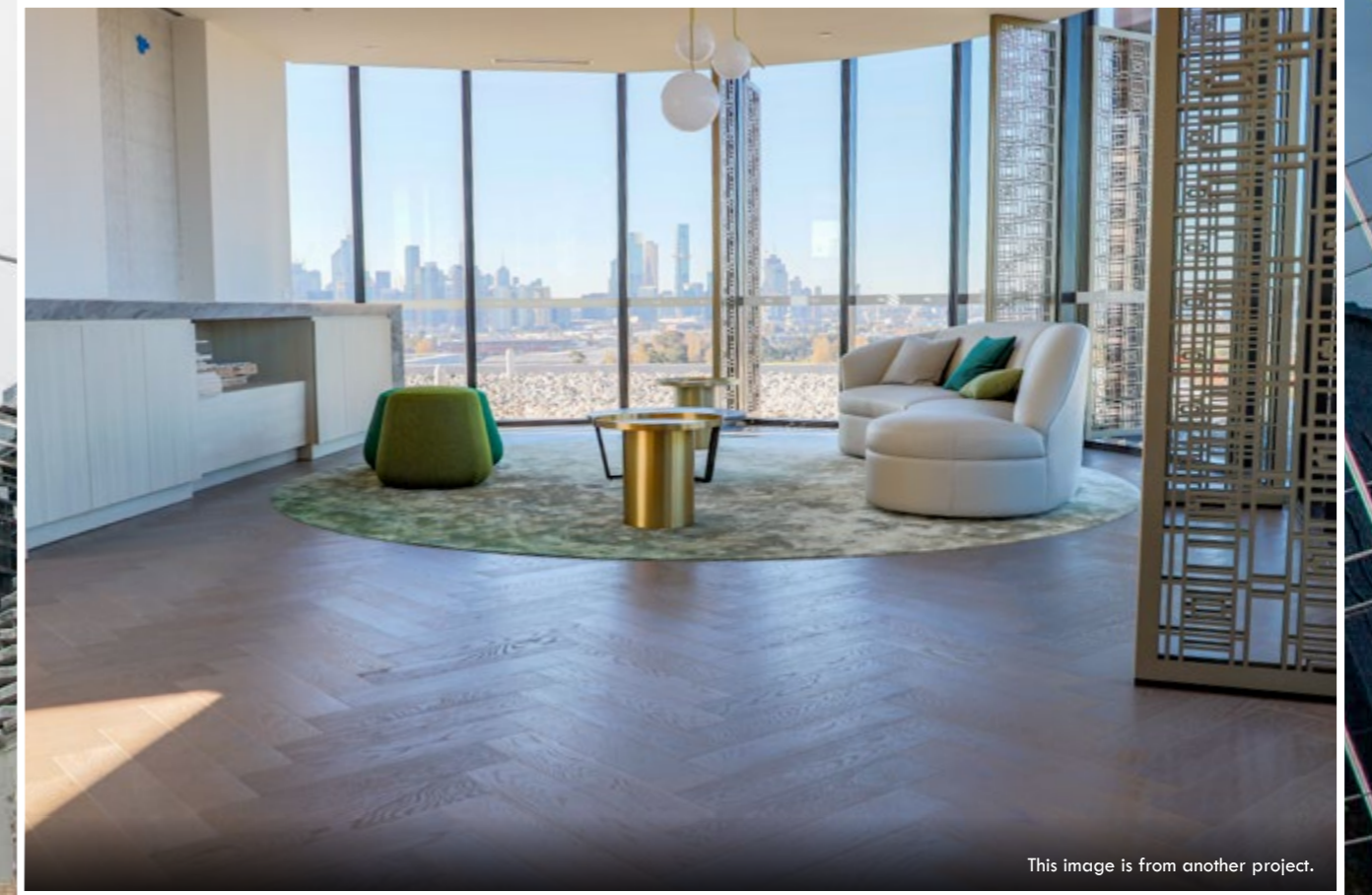
This image is from another project.

Substrate Waterproofing is a leading supplier of quality waterproofing systems and solutions, specialising in polyurea two part spray. The company is now the largest polyurea commercial sprayer in Victoria and has revolutionised a waterproofing system which cuts application and labour costs by up to 75%.