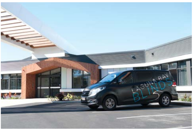
Below Laguna Bay Blinds worked on the project by supplying and installing White Thermalite Plantation shutters in all rooms.