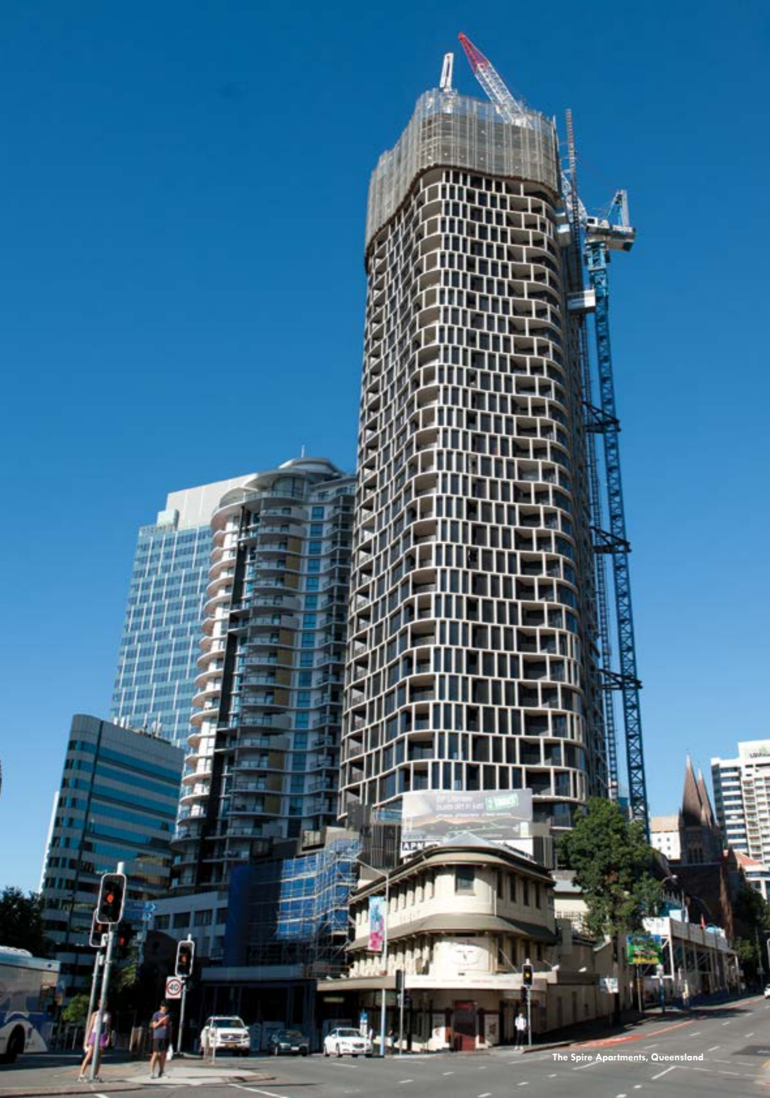
The Spire Apartments, Queensland

Below Damtec® Australasia Pty Ltd supplied the superior acoustic underlay, which was installed by T.A.T Tiling.