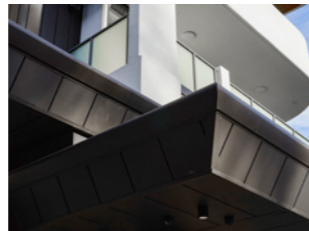
Laser etched mural screen at ground level on Trafalga Street. Part of the Petersham RSL development on the site.