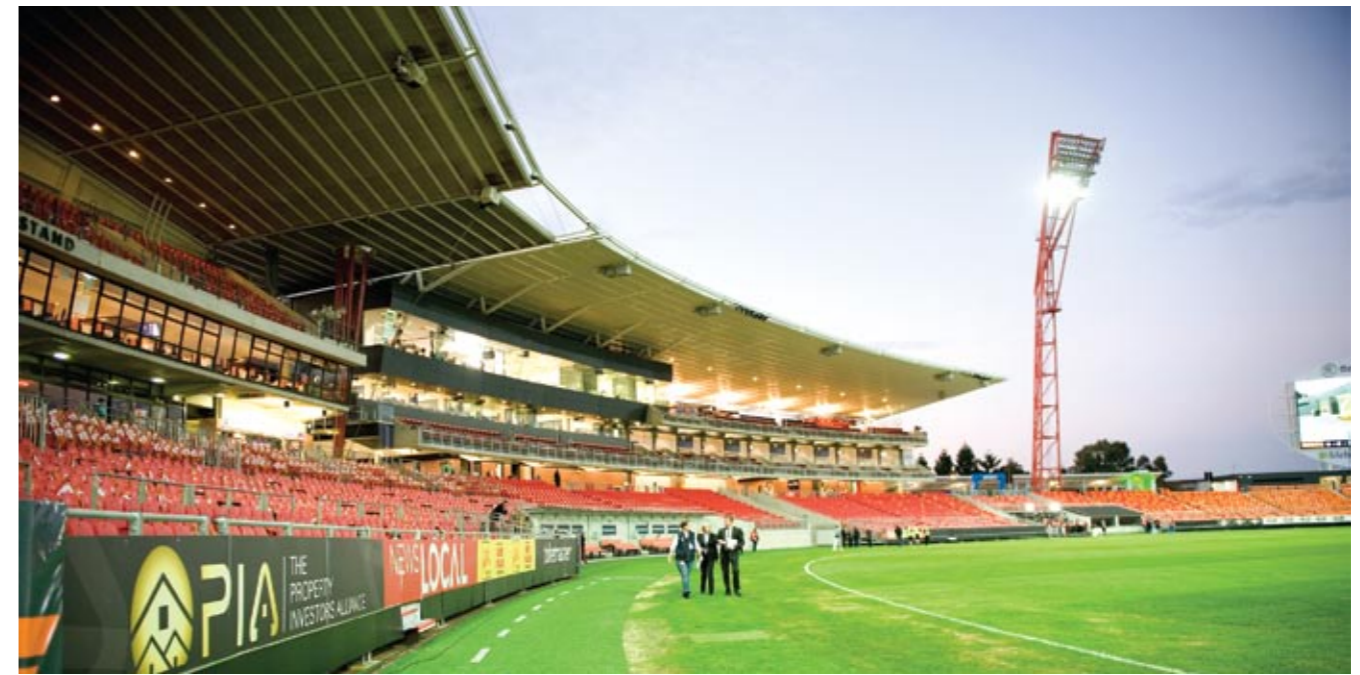
Image Barnwell Cambridge has successfully delivered complete electrical, communications and IT upgrade.