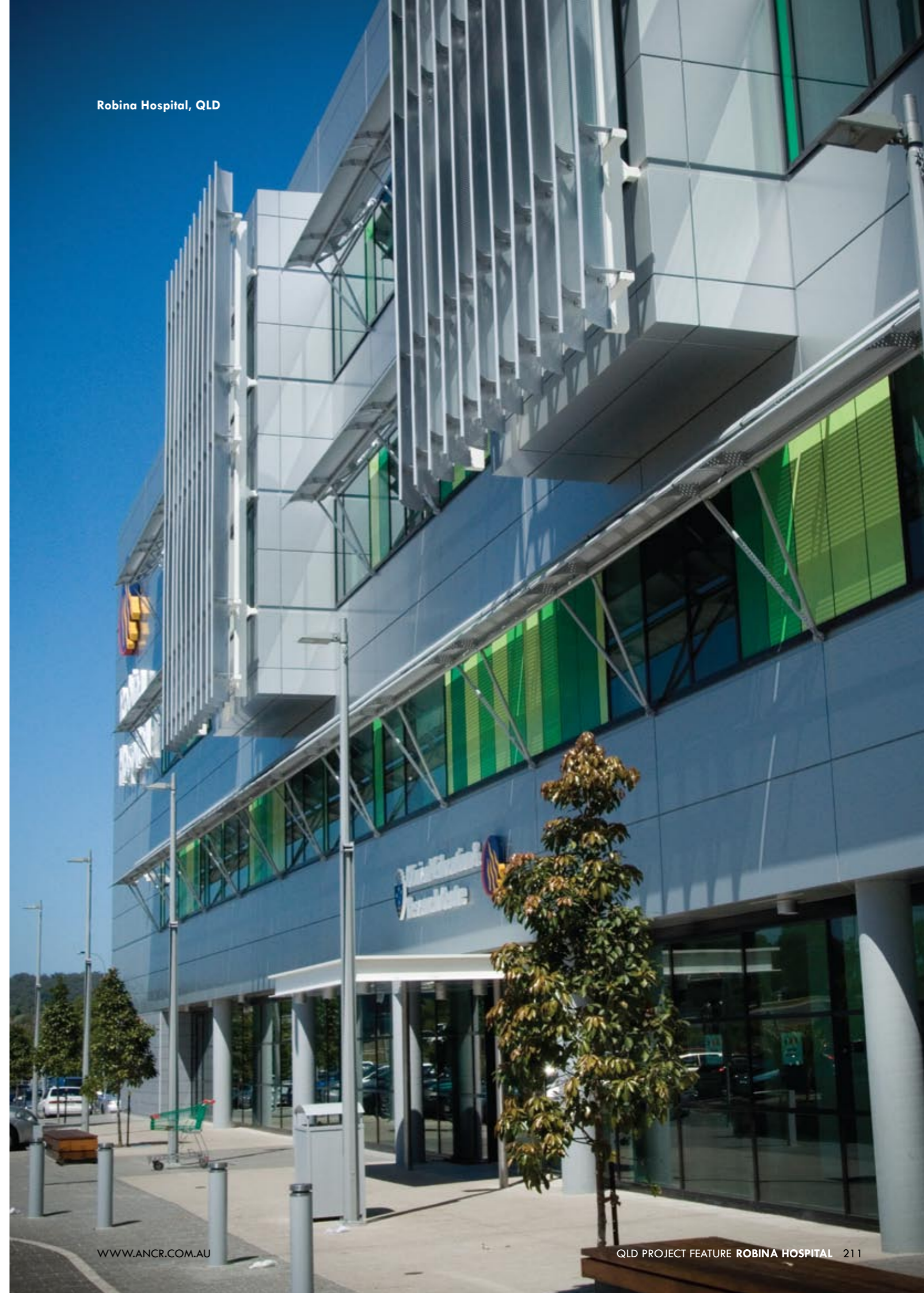
Robina Hospital, QLD

145 Cobalt Street Carole Park QLD 4300 t. 07 3271 1099 f. 07 3271 2084 e. wally@toth.com.au www.toth.com.au