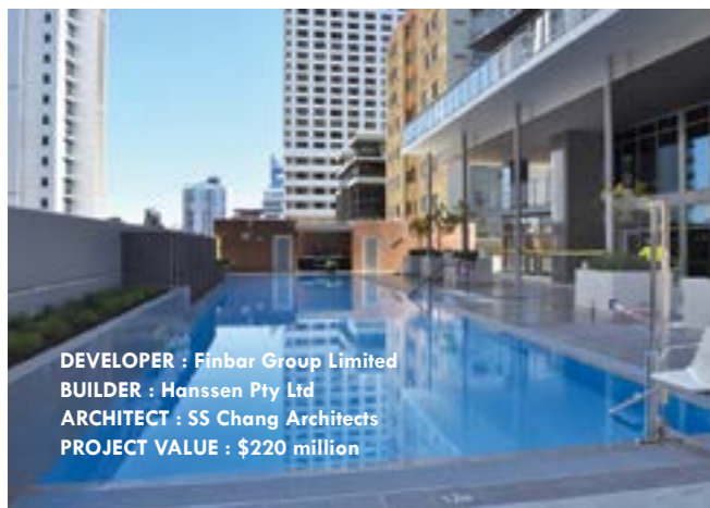
DEVELOPER : Finbar Group Limited BUILDER : Hanssen Pty Ltd ARCHITECT : SS Chang Architects PROJECT VALUE : $220 million