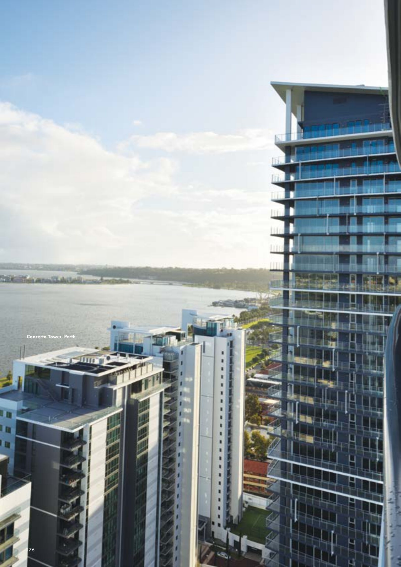
Concerto Tower, Perth