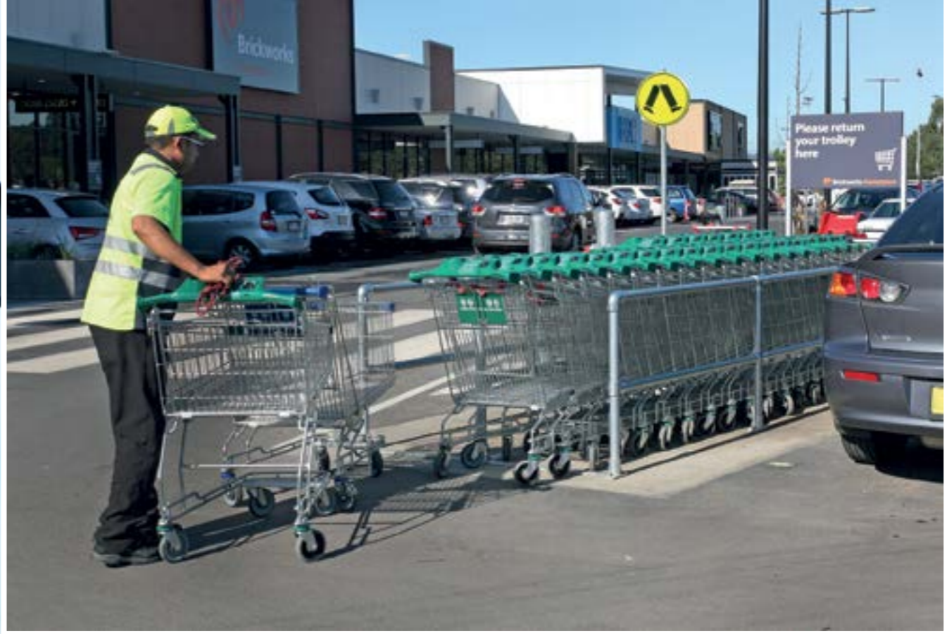
Below Moddex provided flexible and cost-effective Tuffstop Trolley Bays for Brickworks Marketplace.

As a recognised leader in paving and retaining walls, Boral Roofing & Masonry were the obvious choice when it came to constructing the retaining wall at the Brickworks Marketplace.