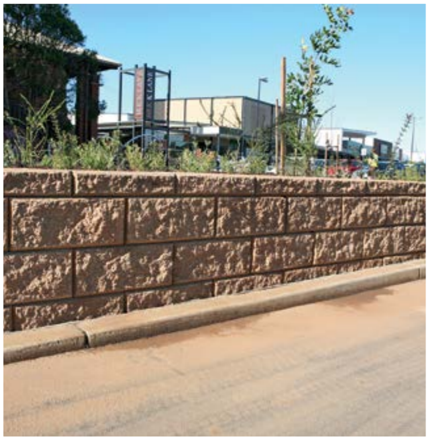
Below Boral Masonry supplied and built the retaining wall system for Brickworks Marketplace.