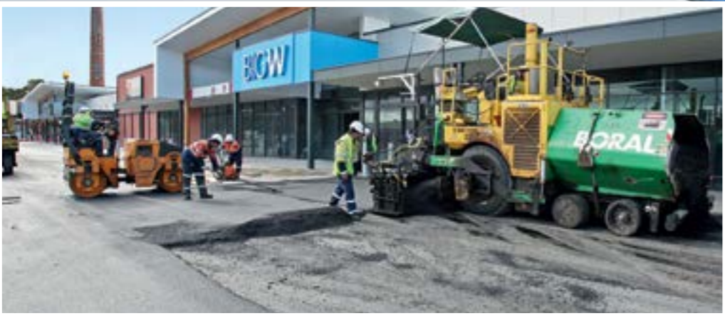
Below Landpac Australia provided ground impact compaction services for the construction of the Brickworks Marketplace.