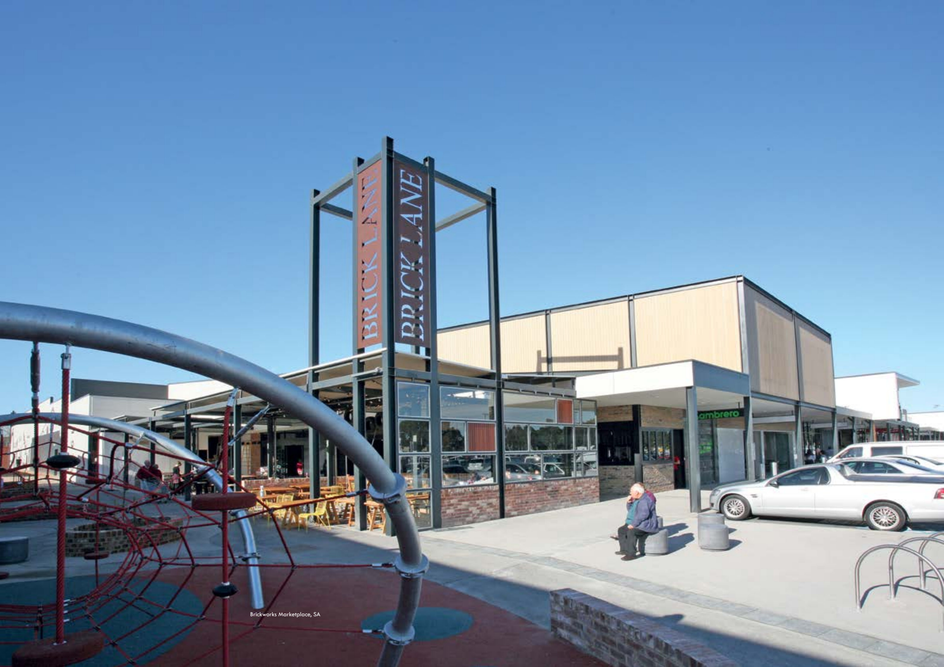
Brickworks Marketplace, SA