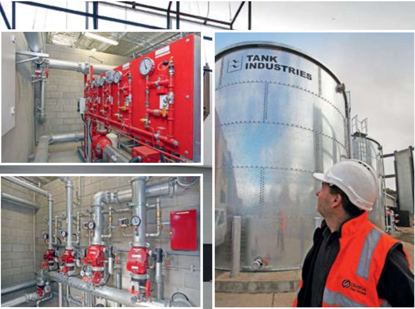
Below Diverse Fire provided and installed fire protection systems on the Brickworks Marketplace.