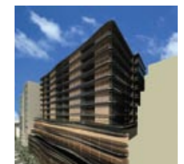
Lilli Apartments South Yarra

Lower Ground Floor 15 Queen Street Melbourne VIC 3000 t. 03 9614 7155 f. 03 9614 7166 e. paul@webberdesign.com