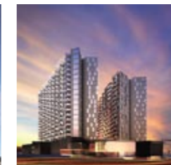
Lacrosse Apartments Docklands