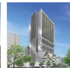
Art On The Park Melbourne