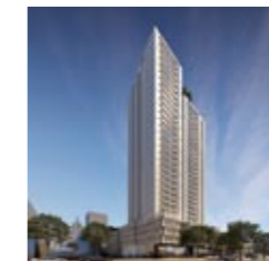
Mackenzie Tower Melbourne CBD

Structural Engineers for the Aerial development would like to congratulate FKP on their landmark project.