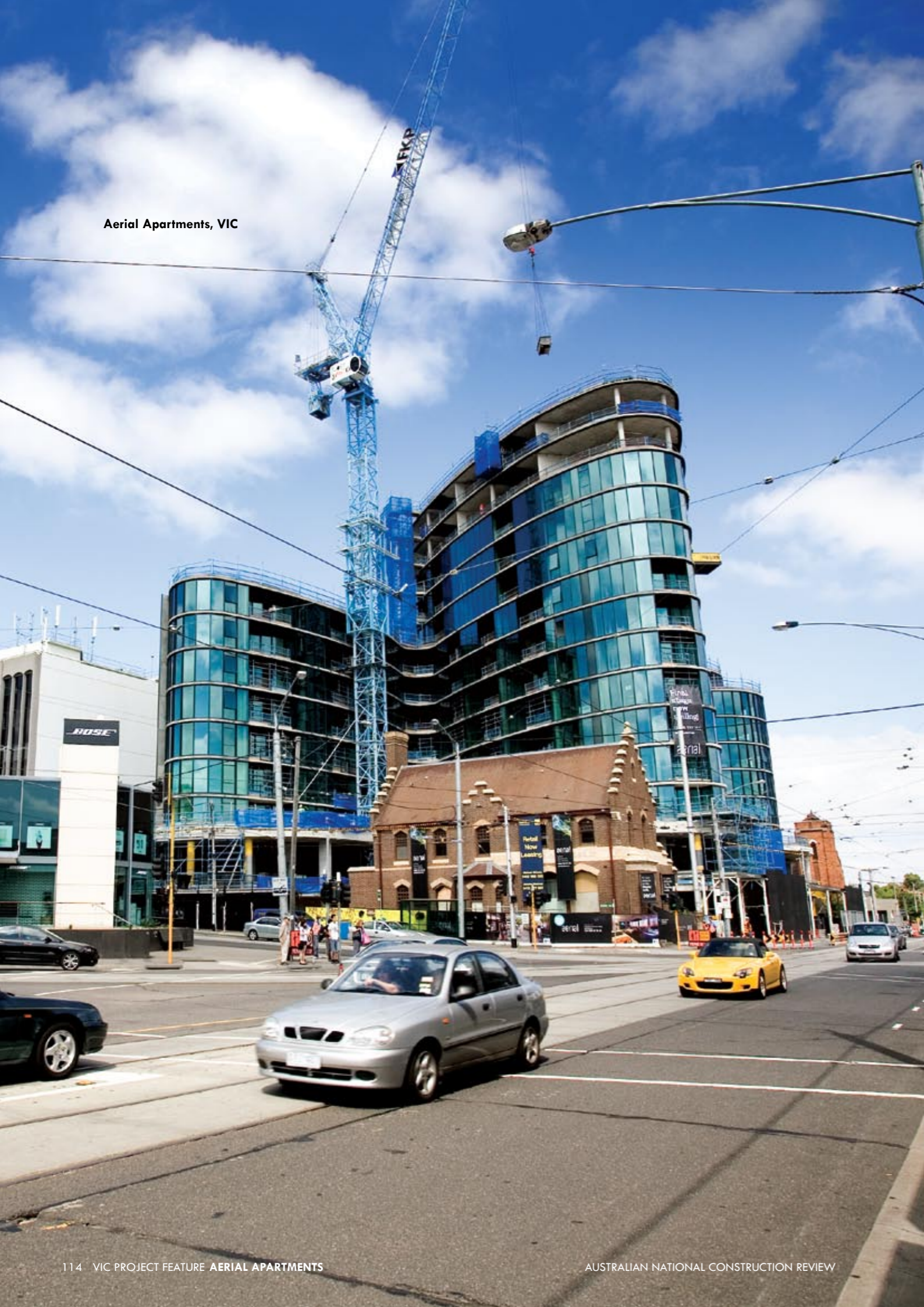
Aerial Apartments, VIC