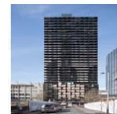
A'Beckett Tower Melbourne CBD