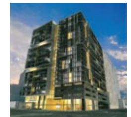
Guilfoyle Apartments South Melbourne