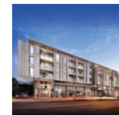
Emblem Apartments Hawthorn