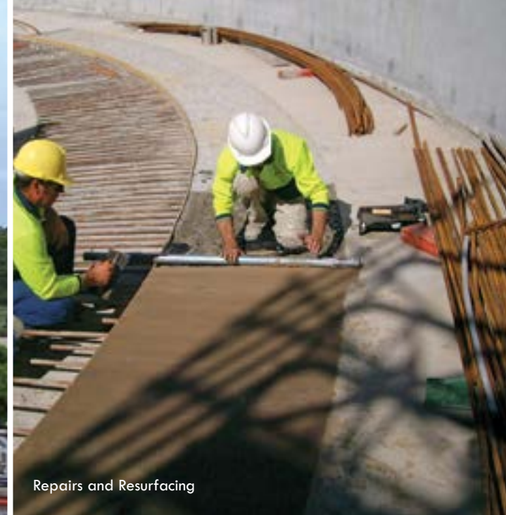
Repairs and Resurfacing