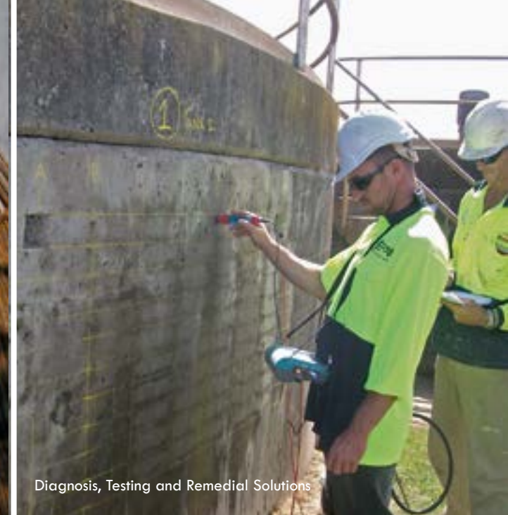
Diagnosis, Testing and Remedial Solutions