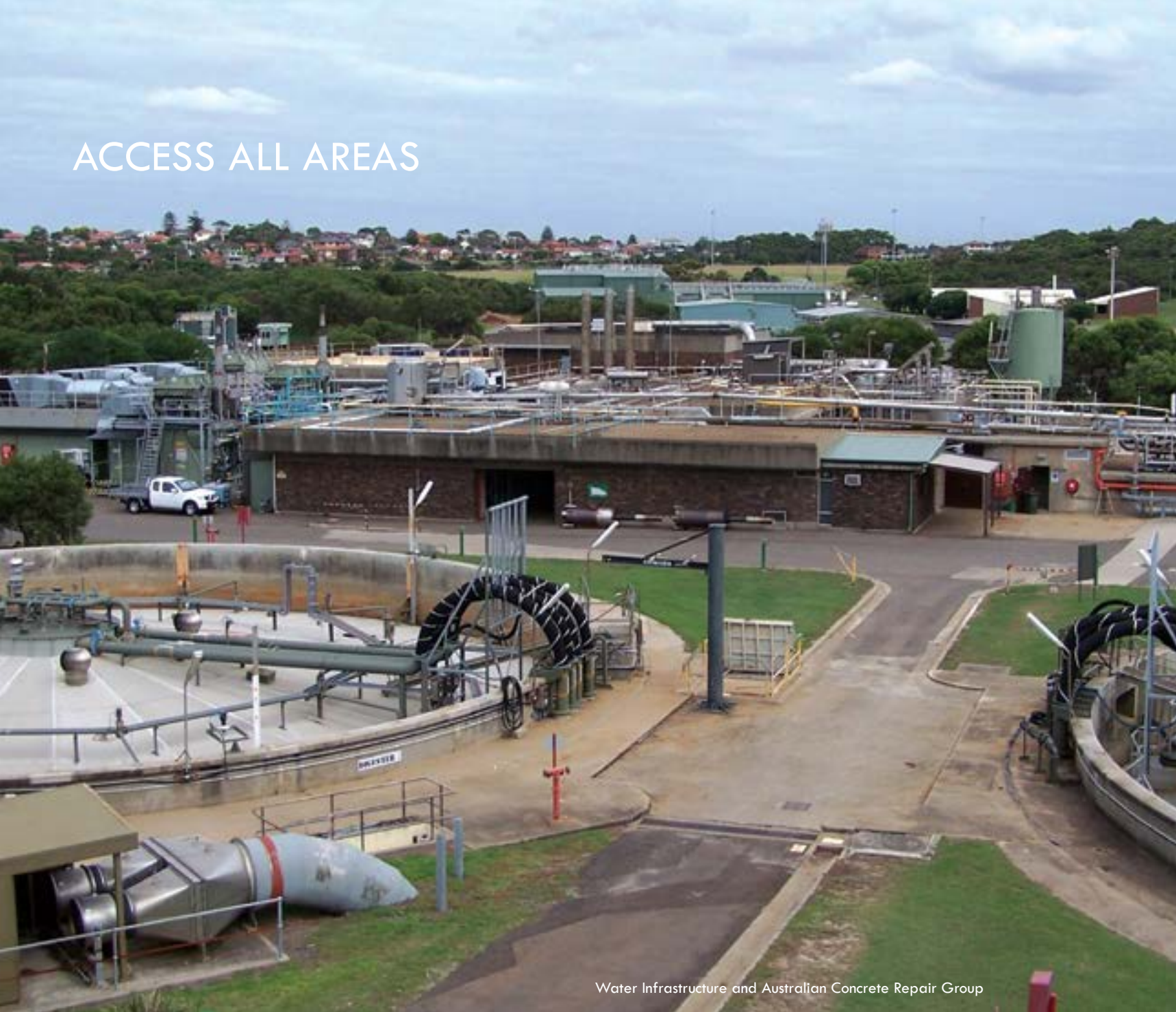
Water Infrastructure and Australian Concrete Repair Group