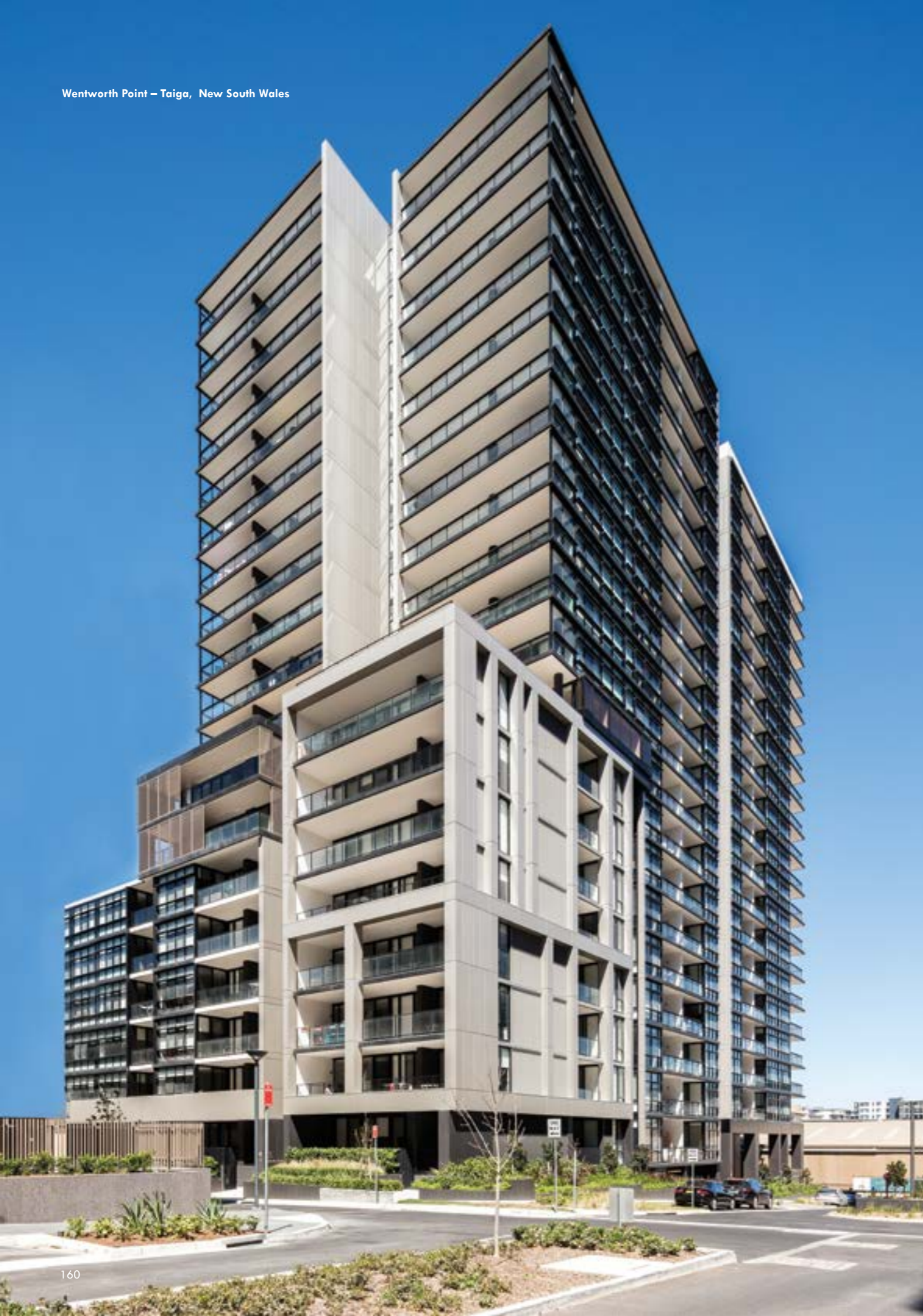
Below City Steel Pty Ltd installed the reinforcing on the project including an unusual hanging column and hanging infinity pool.