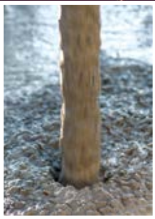
Below CPS Concretors provided placing and finishing services for the Wayfarer.

For 10 years Canberra-based Elite Heating and Cooling has specialised in the supply and installation of air conditioning, heating and ventilation equipment. On top of a decade's worth of experience, Elite Heating and Cooling can now add completing a HVAC installation to Canberra's tallest building to its list of achievements.