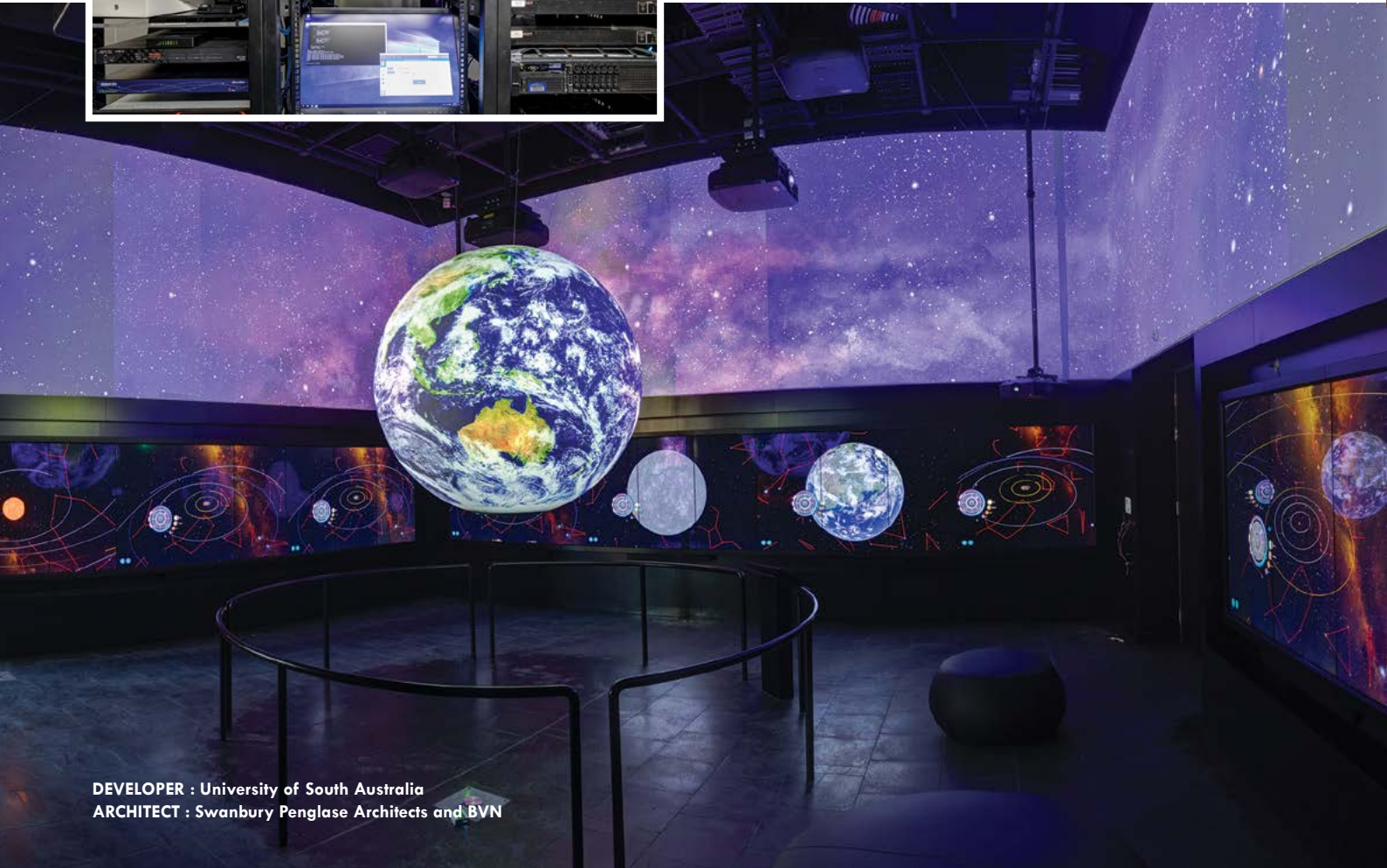
DEVELOPER : University of South Australia ARCHITECT : Swanbury Penglase Architects and BVN

For more information contact Pro AV Solutions, 247 Greenhill Road, Dulwich SA 5065, phone 08 8124 7777, website www.proAVsolutions.com.au