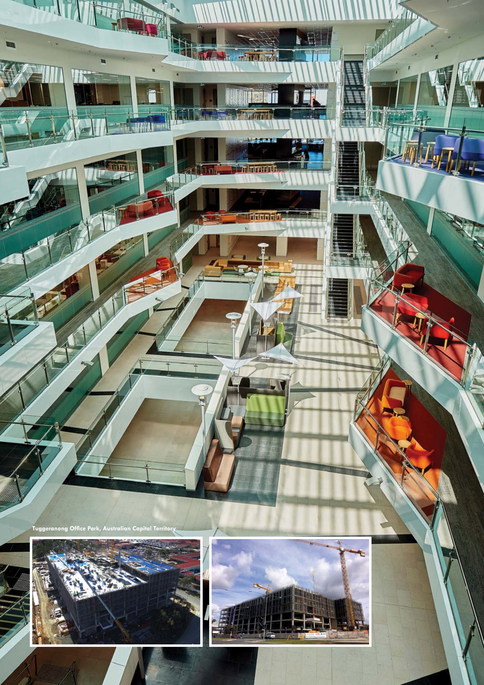
Tuggeranong Office Park, Australian Capital Territory

Below Central West Waterproofing completed all the waterproofing for the Tuggeranong Office Park project.