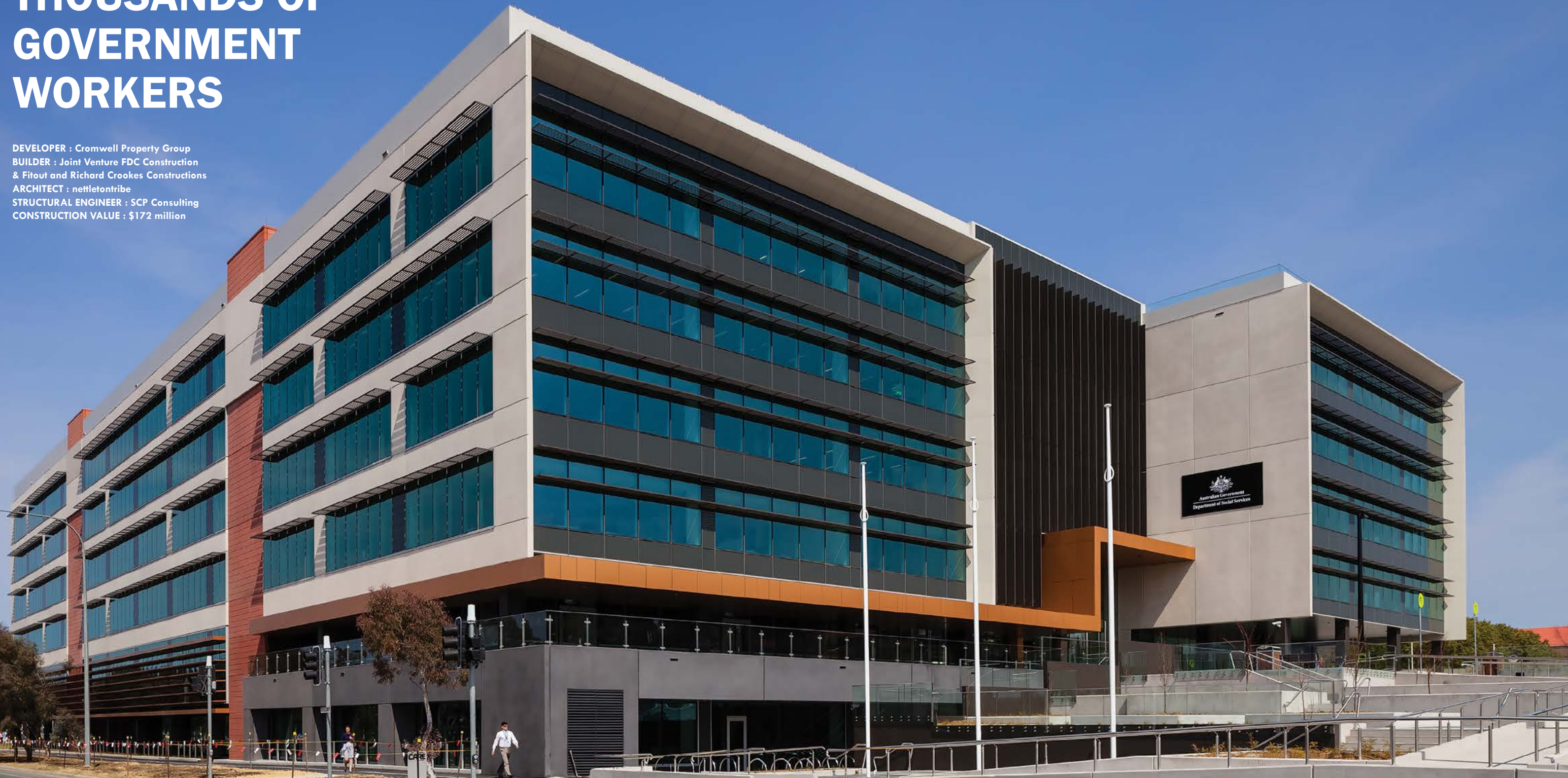
Tuggeranong Office Park, Australian Capital Territory

DEVELOPER : Cromwell Property Group BUILDER : Joint Venture FDC Construction & Fitout and Richard Crookes Constructions ARCHITECT : nettletontribe STRUCTURAL ENGINEER : SCP Consulting CONSTRUCTION VALUE : $172 million